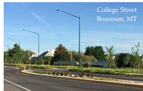
Exhibit 8-3 illustrates an urban cross section with a landscaped median and Exhibit 8-4 illustrates a raised median. These landscape features may include grass, low vegetation, planting areas, rock, mulch, and street trees. These features may also be used as a stormwater management tool,