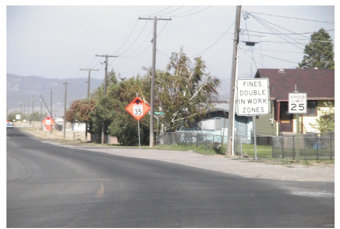
Permanent Posted Sign at 25 mph with Construction Step Down Signs

The photo above shows a typical placement of the step down signs series even though the permanent speed limit sign is 25 mph. The Detailed Drawings call out these signs however, traffic control contractors and MDT construction crews must be aware of the existing project circumstances before implementing the step down signs.