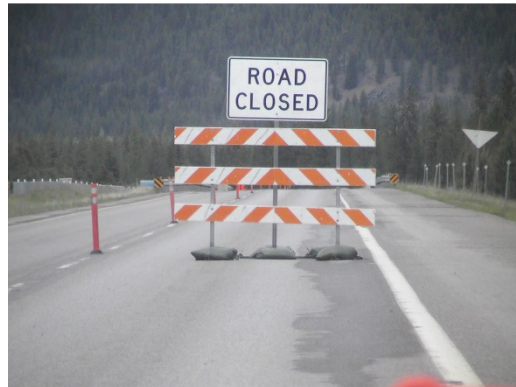
This barricade closure indicates road users may turn right or left.

No Turn Barricades: Where no turns are intended, the stripes should be positioned to slope downward toward the center of the barricade or barricades.