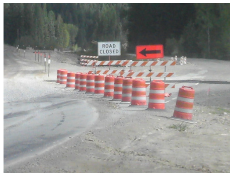
This barricade closure indicates road users must turn left.