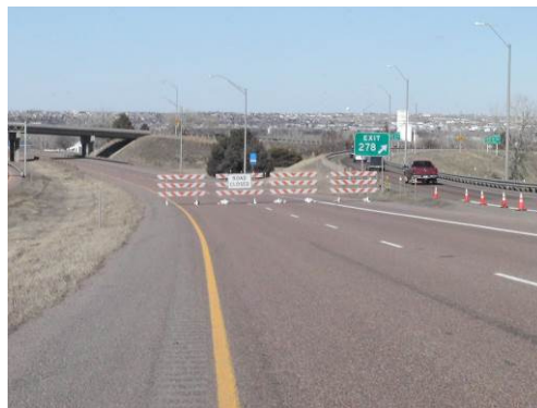
This barricade closure indicates no turns are intended.