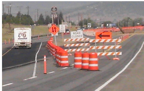
Signs on separate mounting device behind barricades.

The most common method of using signs with barricades is to mount the sign on a crashworthy device and place the unit behind the barricade. One advantage of this system is that both the barricade and the manner in which the sign is mounted are both crashworthy. Another advantage is that the barricade does not become top-heavy and tip over in high wind areas. Also, the adjustment of the sign height is easy for use in rural areas and urban and interstate highway areas.