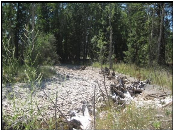
2013 Photo Point 2.1: View of root wads on north bank. Compass: 225 (Southwest)