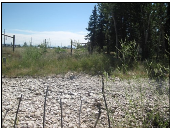
2013 Photo Point 2.2: View across channel of south streambank. Compass: 180 (South)