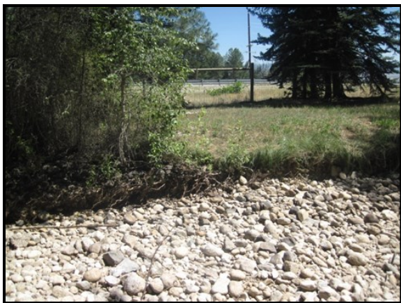
2013 Photo Point 1.3: View of south streambank. Compass: 90 (East)