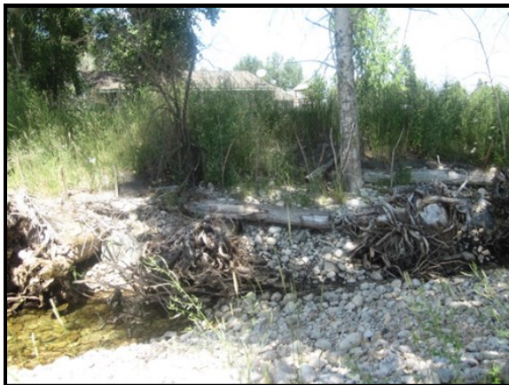
Photo Point 4.1: View from south bank looking upstream from downstream extent. Compass: 270 (West)