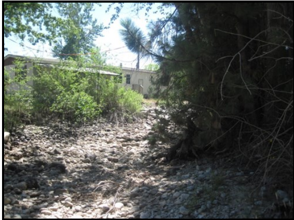
2013 Photo Point 1.4: View of dry channel looking upstream. Compass: 230 (Southwest)