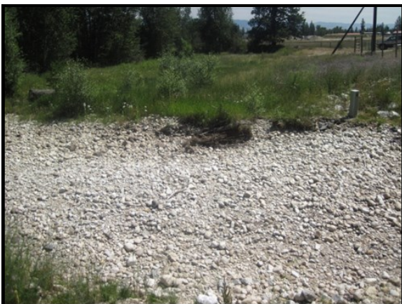
Photo Point 3.1: View downstream from north bridge abutment. Compass: 90 (East)