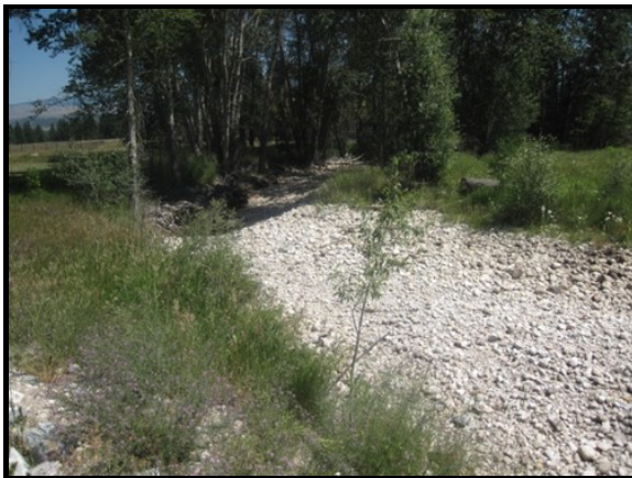
Photo Point 2.3: View from north bank looking across channel. Compass: 135 (Southeast)