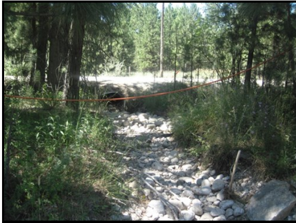
2013 Photo Point 1.1: View of tributary/culvert entering from west. Compass: 270 (West)