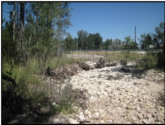
2013 Photo Point 1.2: View of north streambank looking downstream. Compass: 45 (Northeast)