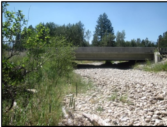
Photo Point 3.3: View across channel of south bank from north bridge abutment. Compass: 180 (South)