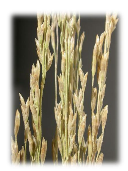
Nuttall's alkali grass