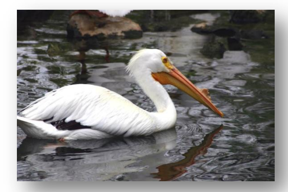
American White Pelican

Bolded species were observed in 2006; 1 observed during fall 2005 post-construction inspection; 2 observed by MDT.