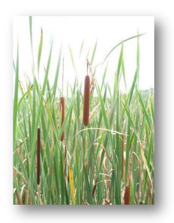
<u>Typhia latifolia</u> (Broadleaf cattail)