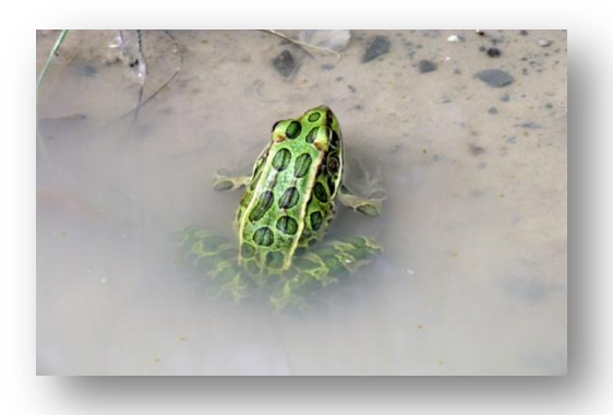
Northern Leopard Frog