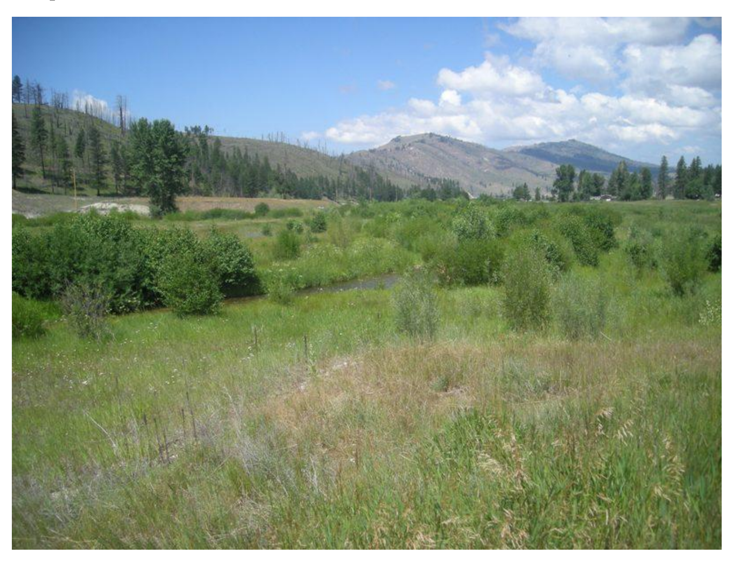
Click the icon below for complete monitoring reports for this site (2002 to 2010)