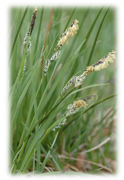
Sedge (Carex nigra)