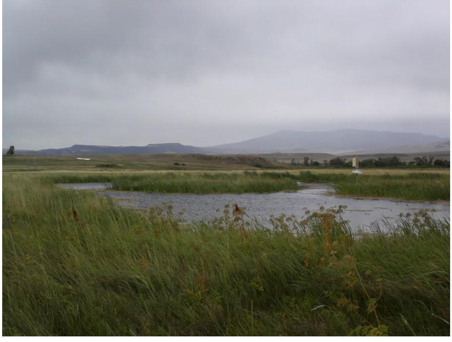
Click the icon below for complete monitoring reports for this site (2007 to 2010)