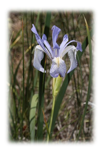
Rocky Mountain Iris