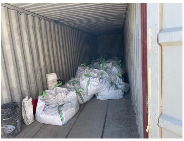
Figure 3: Sacks of MT-UHPC in storage container