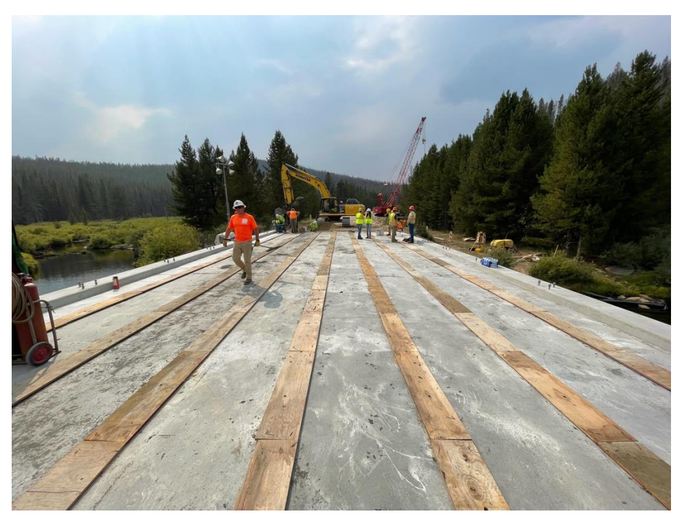
Figure 5: Keyways with top forming