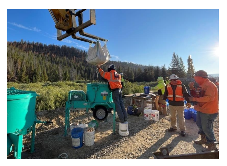
Figure 2: Sack of dry mix being added to the mixer

during the Trail Creek field demonstration project discussed in the introduction. During this project, 3-ft<sup>3</sup> batches of MT-UHPC were premixed according to the procedures outlined above and placed into sling bags. Once mixed, the sacks of MT-UHPC were stored in a shipping container shown in Figure 3. This shipping container contained approximately 100 sacks of MT-UHPC, and provided a convenient method of protecting the material from the elements and transporting it to the jobsite. During construction, the premixed dry ingredients were added to the mixer by hoisting a premixed sack and depositing it in the mixer through the hole in the bottom of the sack, as shown in Figure 2. The HRWR and mix water were weighed on site, and then added to the mixer, at which point the procedure outlined above was followed. After this mixing was complete, the MT-UHPC was removed from the mixer and placed.