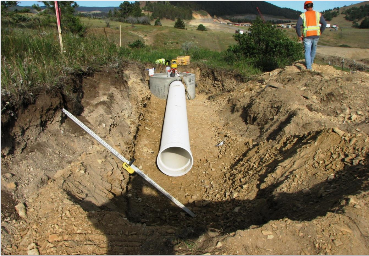
↑ The first section of the A-2000 is placed (view west).