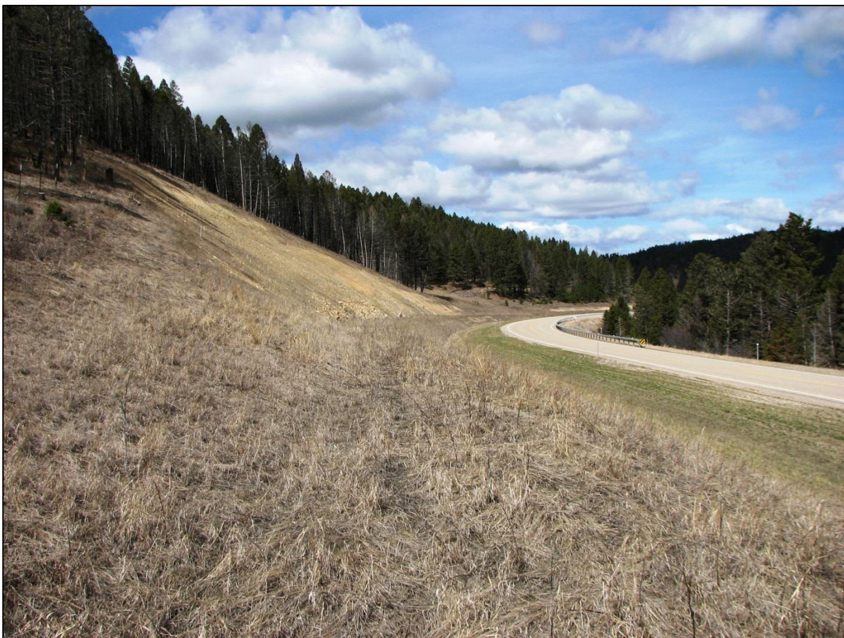
↑ View west: Start of approximate location at the east end of the 18" A-2000.