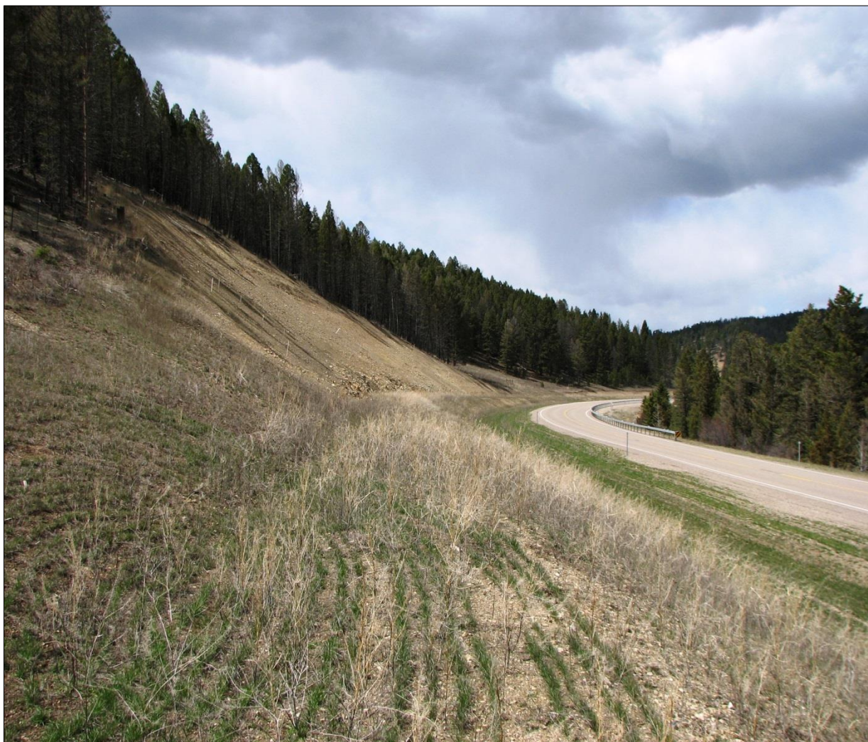
↑ View west: Start of approximate location at the east end of the 18" A-2000.