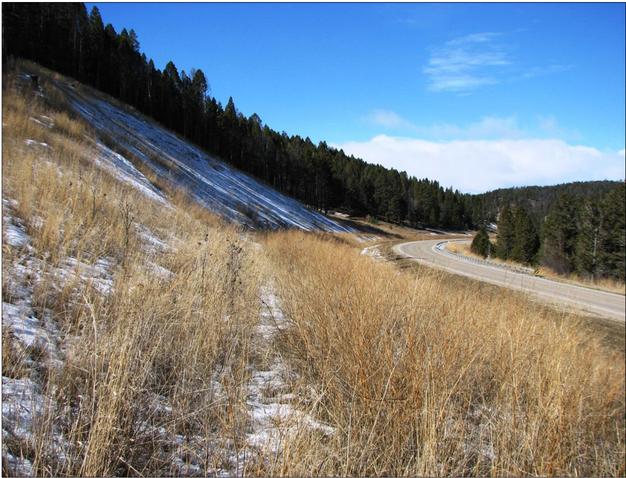
↑ View west: Start of approximate location at the east end of the 18" A-2000.