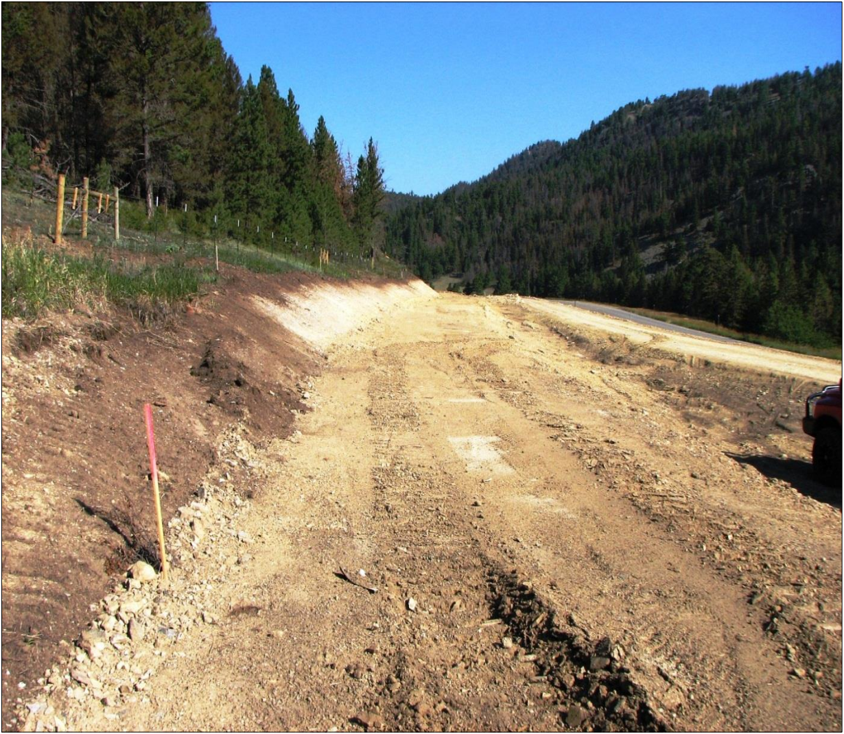
↑ Representative image of the completed A-2000 18" installation (view west).