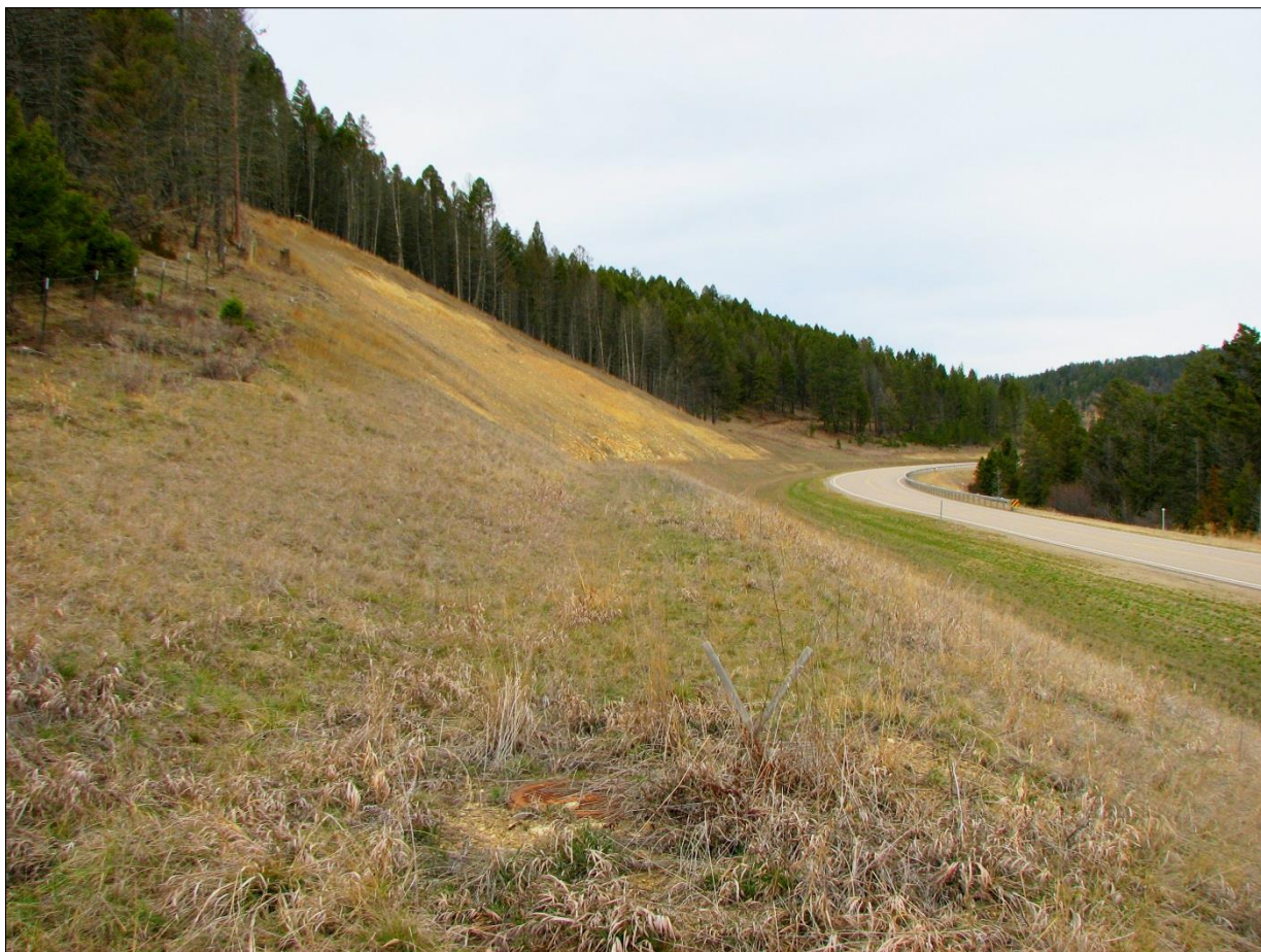
↑ View west: Start of approximate location at the east end of the 18" A-2000.