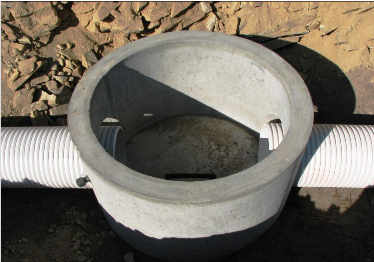
↓ Interior view of manhole connections.