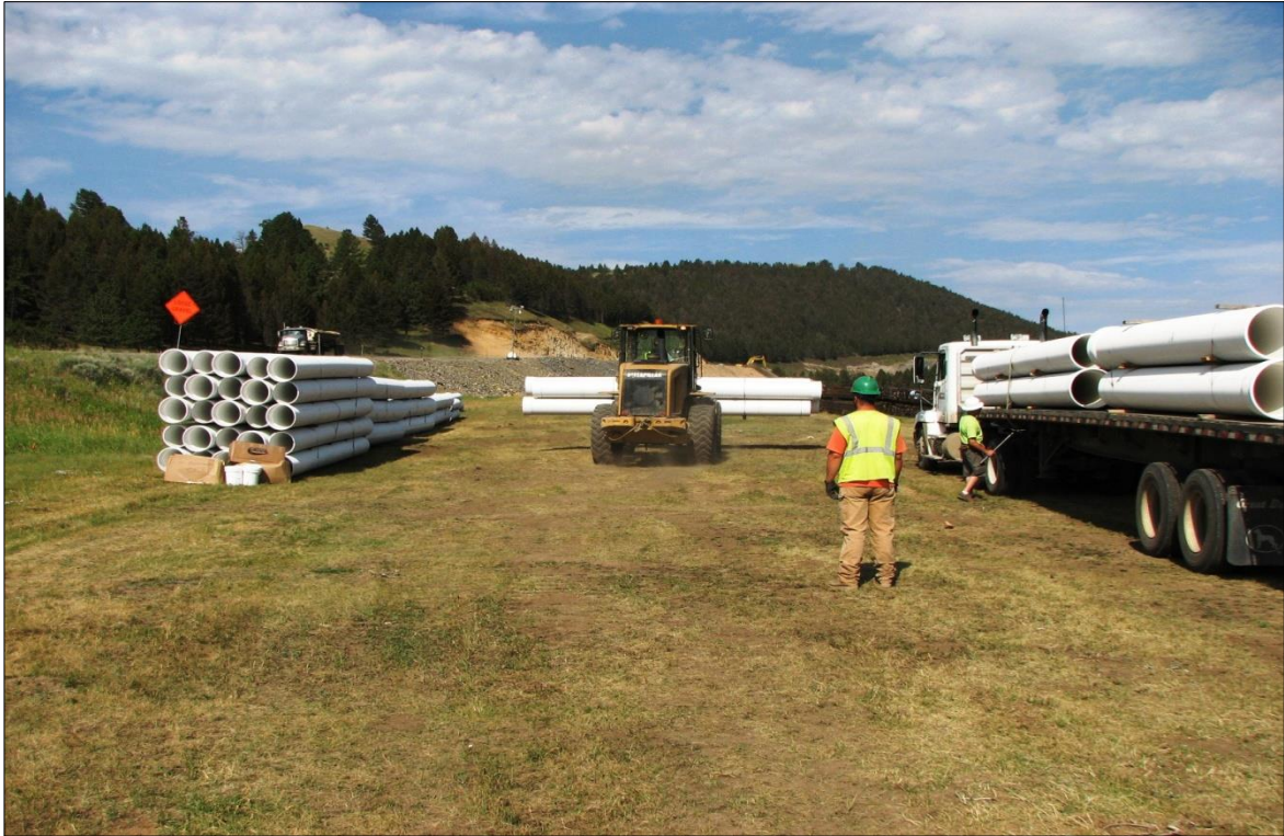
↑↓ Contech A-2000 pipe is delivered on-site.