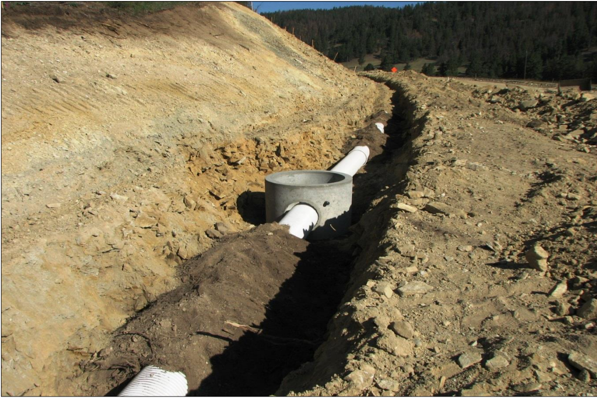
↑ Example image of pipe to manhole installation.