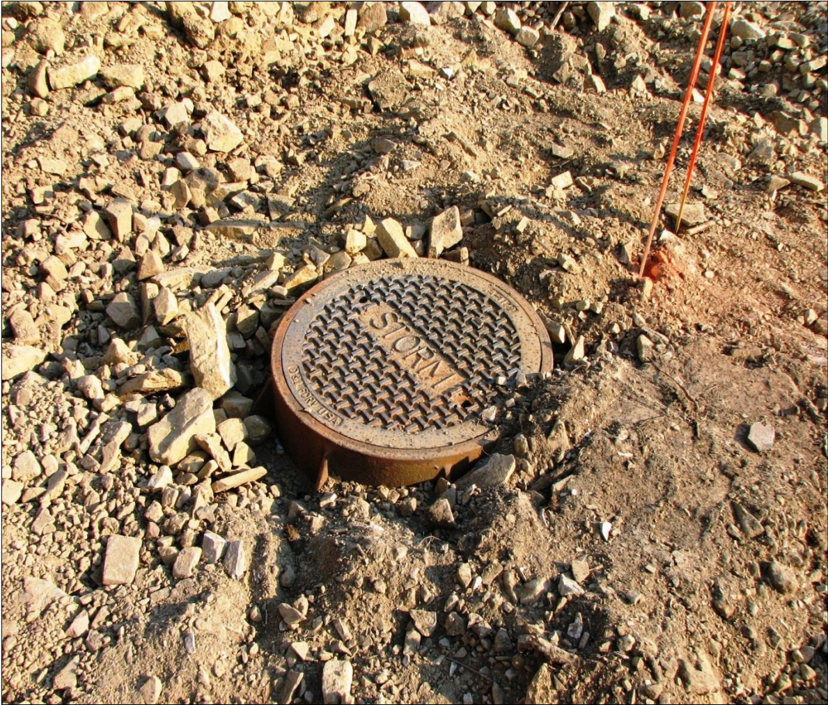
↑ Completed manhole installation.

This file photo is an example of what a completed grouting will look like (yellow arrow).