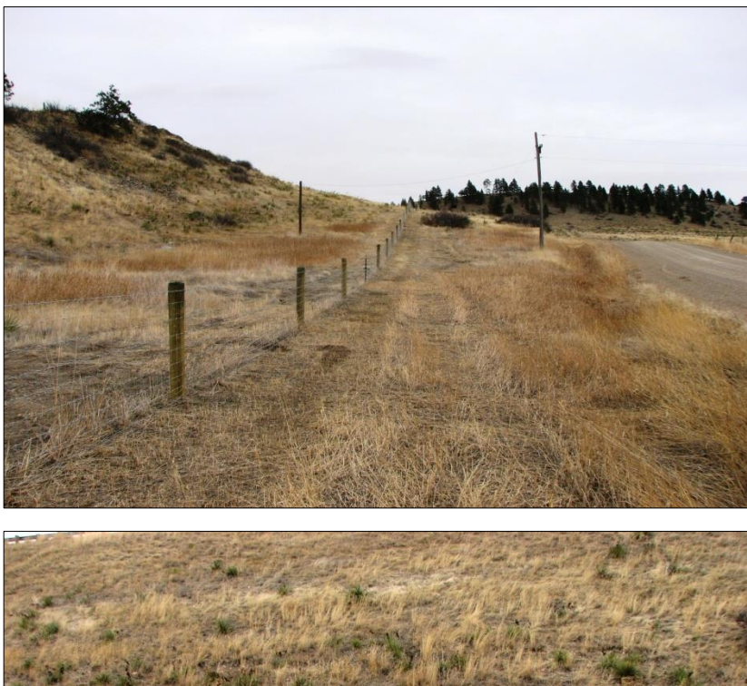
← ♥ Representative images of the Stay-Tuff fence taken in early April 2012.