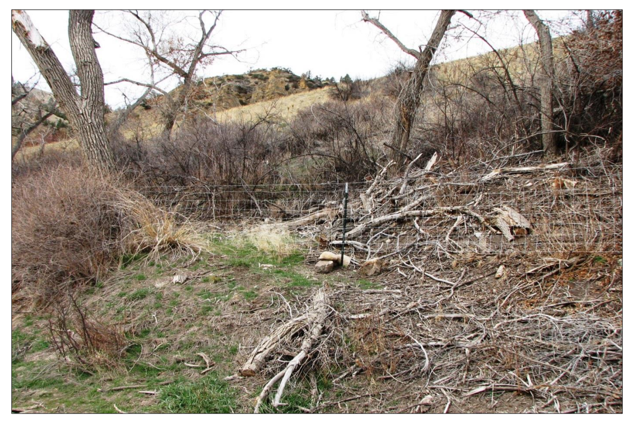
↑ ↓ Images of the repaired Stay-Tuff fence section as document in March 2012, (page eight (8)).