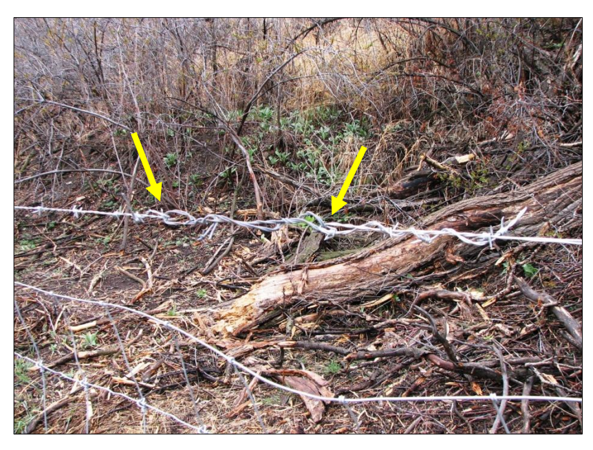
← Maintenance reported the top barbed wire strand had stretched and needed to be cut and retightened with a supplement wire.