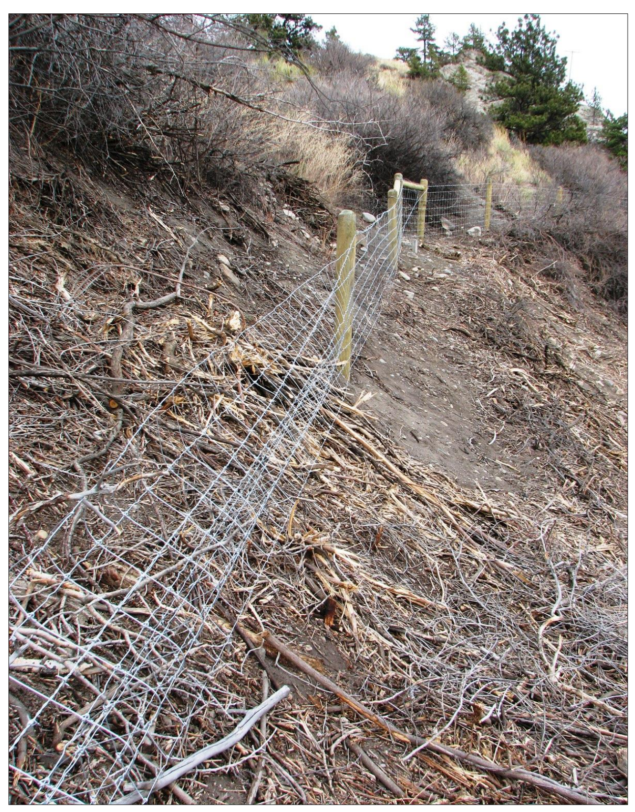
♠ View north of damaged fence section.