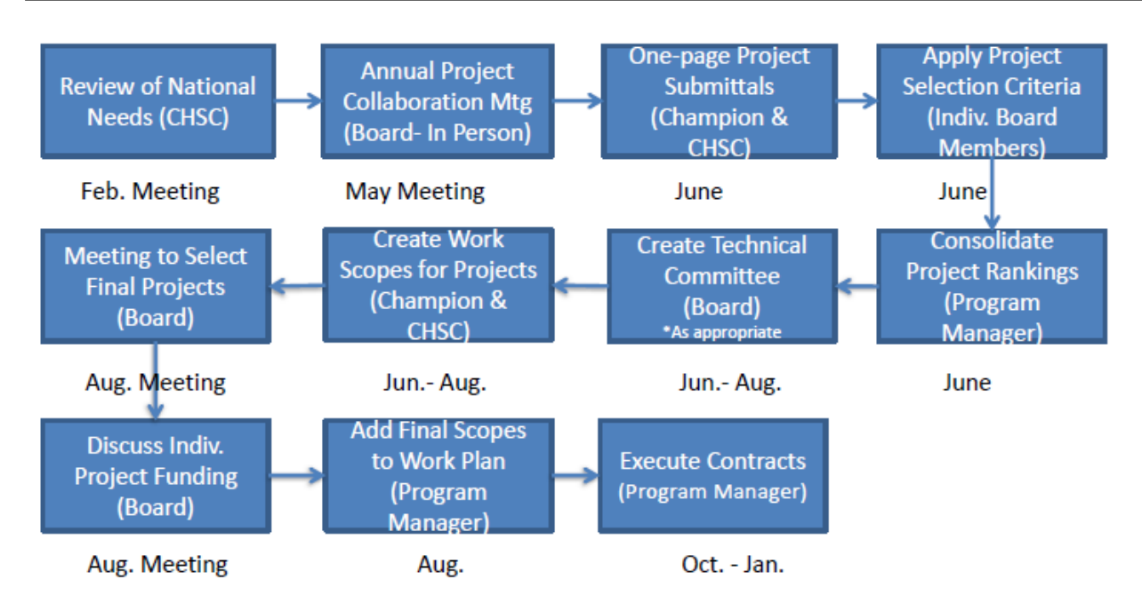
Figure 2: Project Development and Selection Process