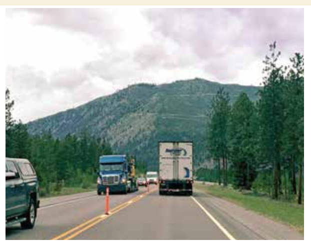
Example of crossover traffic on I-90.