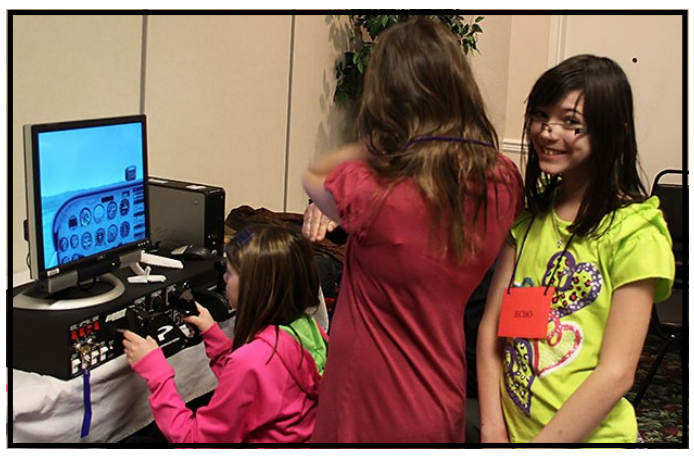
Fifth graders from Margaret Leary School loved the aviation education day especially the flight simulator!