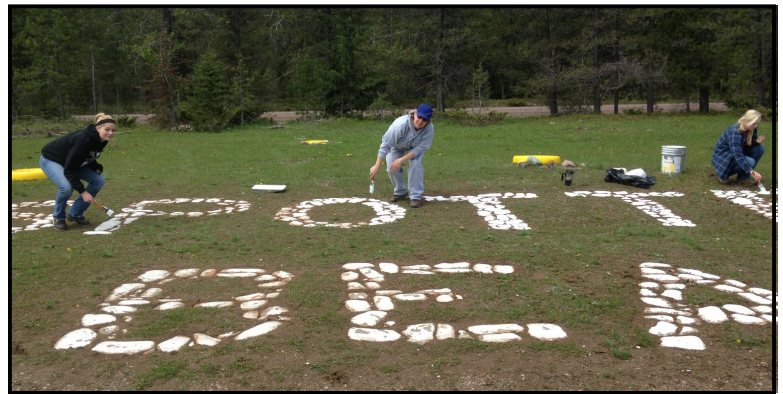
Rock painting crew!

It was a great day with a lot accomplished. Thanks everyone for the fine work.