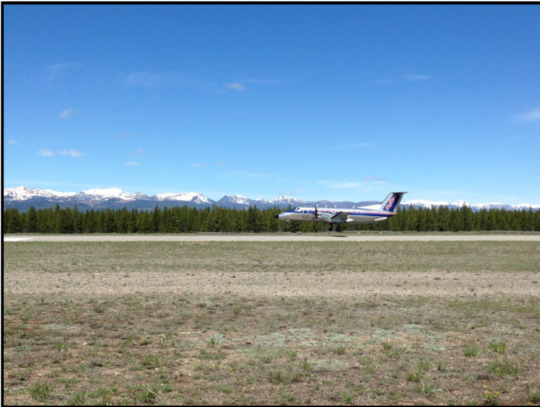
First Brasila EMB – 120 landing for Summer 2013 at WYS.

Yellowstone Airport's (WYS) scheduled air carrier service has returned once again for the 2013 summer season! There are 2 daily scheduled flights Monday-Friday and 3 daily scheduled flights on Saturday and Sunday from Salt Lake City (SLC) to Yellowstone Airport (WYS). Travelers can take advantage of this convenient service through Delta Airlines operated by SkyWest by calling Delta reservations at 800.221.1212 or by visiting www.delta.com .