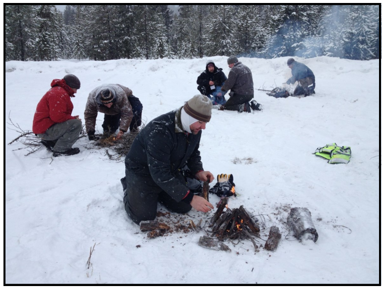
Participants in the 2013 Winter Survival Course practice their fire starting skills.

Over priming while hand propping an aircraft can turn a good day into a disaster. An over prime and back fire can start