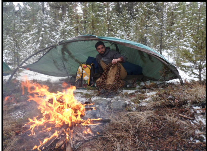
A cozy shelter from the 2013 clinic!

The newly designed and improved 406 ELT is what the satellites are tuned to, with this new transmitter on board the aircraft, rescue time improves greatly. Having a personal beacon such as a 406 Personal Locator Beacon, a Spot Tracker or Spider Tracks will help guarantee a quicker response to your location. The price of these locator beacons are low and when you're on the