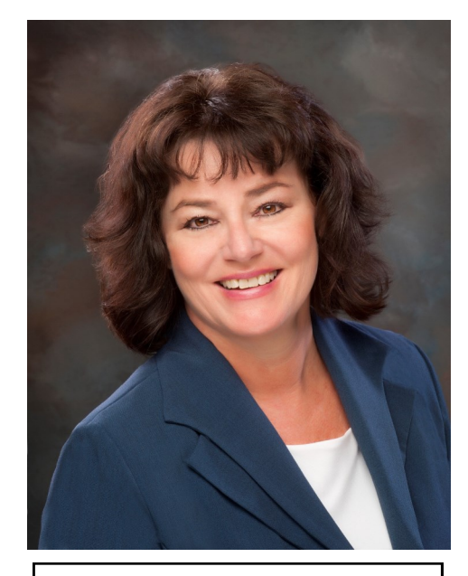
Montana and the Sky Department of Transportation

MDT attempts to provide accommodations for any known disability that may interfere with a person participating in any service, program or activity of the Department. Alternative accessible formats of this information will be provided upon request. For further information call (406) 444-6331 or TTY (406) 444-7696. MDT produces 1,800 copies of this public document at an estimated cost of 39 cents each, for a total cost of $702. This includes $483 for postage.