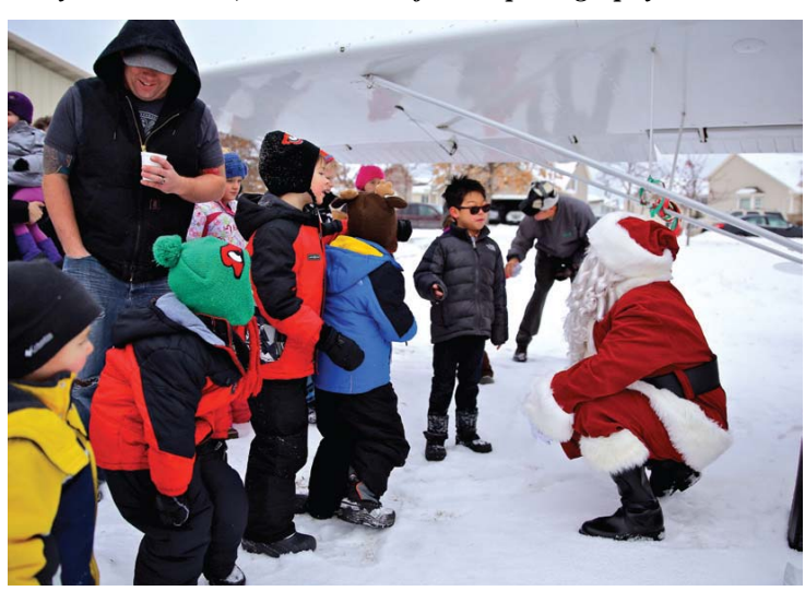
Santa meets children eye to eye to hear their wishes.