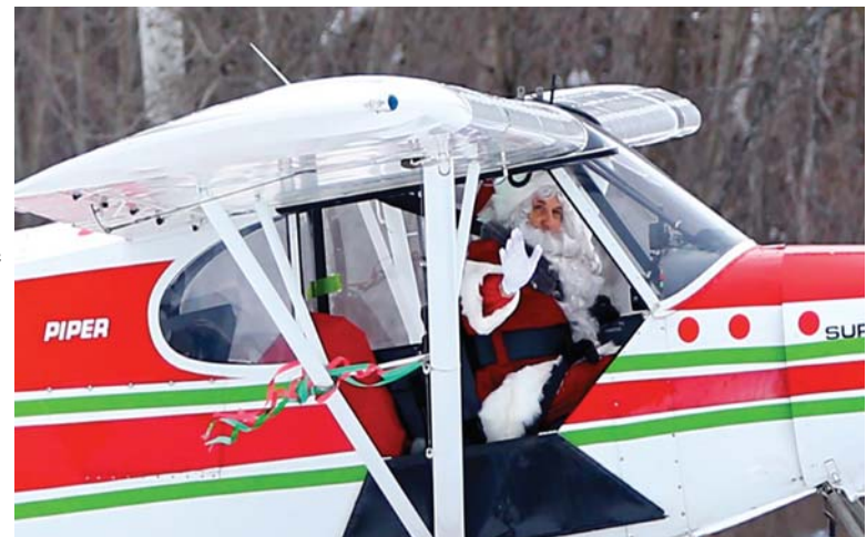
As always, the jolly guy in the red suit arrives just in time!