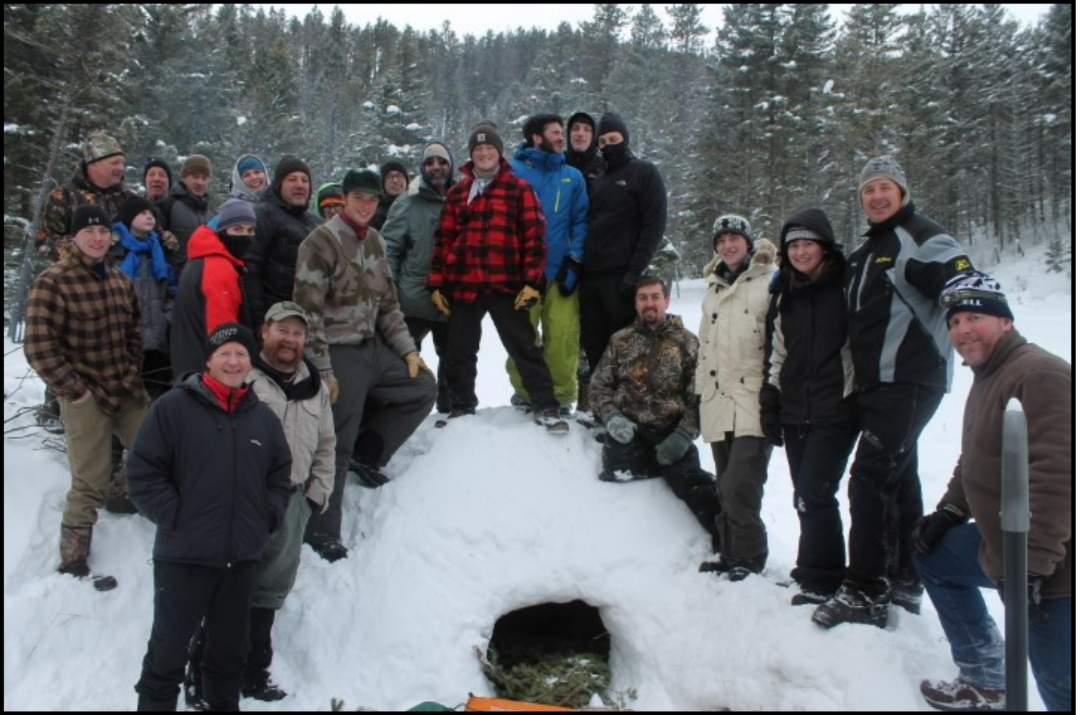
Picture taken at the 2015 Winter Survival Clinic at the Duvall Inn in Lewistown, MT