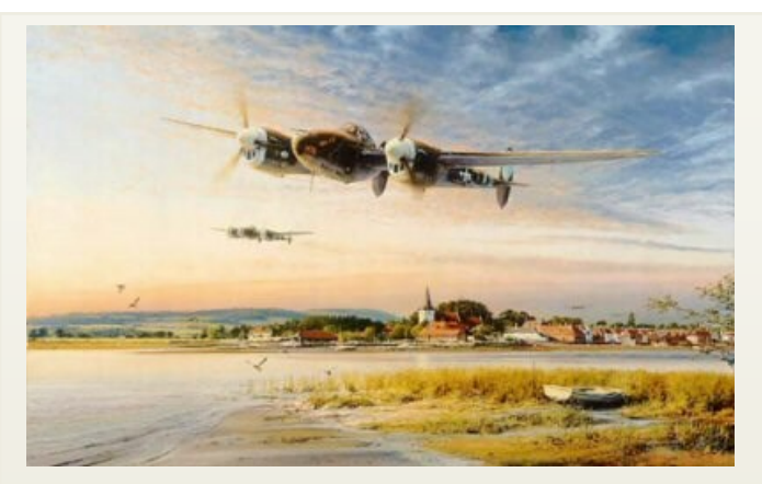
December 8, 2016 10:40 a.m. Original sized to fit document.