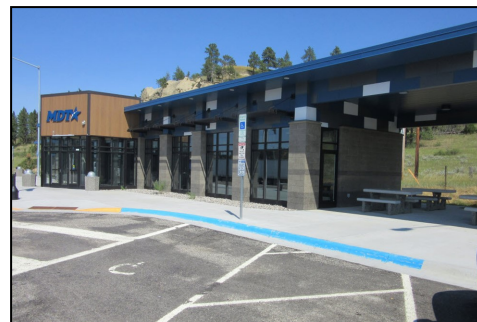
New Hysham rest area.

Less than a year after opening, MDT's new rest area at Hysham is considered among the best of its kind by the traveling public. The energy-efficient building has a heat recovery ventilator, which results in