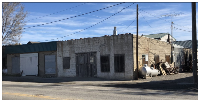
1913 concrete structure located in Columbus, Montana.

This seeming bland building near the railroad tracks possesses a wealth of history important not only to Columbus, but to eastern Montana. Its connection to Thomas Edison is also interesting. It just goes to prove that in sometimes ordinary packages lurk real treasures.