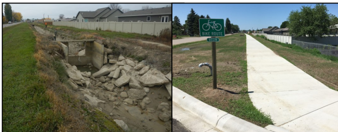
14 th Street SE/9 th Avenue SE Path in Sidney—before (left) after (right).

The Sidney project included a new three-mile long concrete path and sidewalk along 14 th Street and 9 th Avenue in Sidney. The project also enclosed an irrigation ditch adjacent to the new path in a 48-inch pipe. The project extended the existing multi-use path system that was built with Community Transportation Enhancement Program funds. The path connects Sidney High School to an adjacent neighborhood and includes utility adjustments, Americans with Disabilities Act-compliant ramps, signing, and revegetation. The construction cost was approximately $950,000.