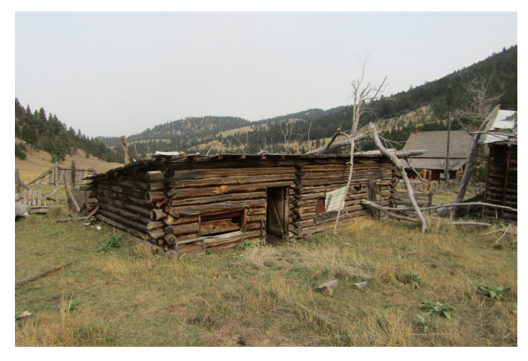
The original stage station built in 1865 as it stands at the site.

One such home station still exists on the old road between Virginia City and Helena. The site is privately owned; the location and name of the station will not be revealed here. In 1864, Milo Cortright discovered promising gold, silver, and copper mineral prospects in the Elkhorn Mountains and built a cabin in the creek bottom just east of the mine. The cabin soon became an important stop and community center on the road. Traces of the old road can still be seen north and south of the site and in front of the station. The station, in this case, consisted of a horse barn and other ancillary structures. Fifteen to twenty cabins were once located across a shallow coulee to the south of the station. Indeed, it probably resembled a crude settlement to travelers on the road. The original stage station on the site, however, closely matches a description by Mark Twain in his 1872 book, Roughing It. The station consisted of a "hut for an eating-room for passengers. This latter had bunks in it for the station-keeper and a hostler or two. You could rest your elbow on its eaves, and you had to bend in order to get in at the door. In place of a window, there was a square hole about large