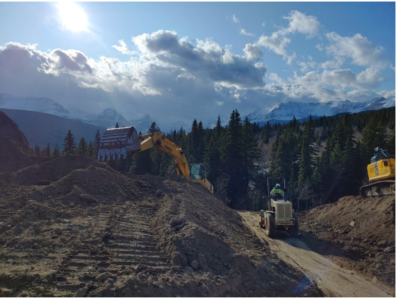
Active construction on the North of Kiowa North project near Browning, Mont. (featured on Page 1)

Montana Fish, Wildlife & Parks (FWP) will accept applications for this grant from January 18, 2022—February 28, 2022, via the online system: <a href="https://funding.mt.gov/index.do">https://funding.mt.gov/index.do</a>