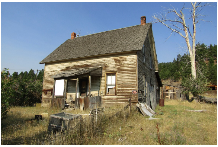
The hotel, believed to be originally constructed as a house by the Getts family still stands at the site. It was built in approximately 1873.

The arrival of the Helena, Boulder Valley and Butte Railroad Company in 1887 and the Montana Central Railroad in 1888 spelled doom for the stage line and the station. Both railroads were visible from the site and neither one chose to include it on the rail line. Thereafter, a former miner ran the property as a cattle ranch well into the twentieth century. Indeed, the site is somewhat of a microcosm of the evolution of transportation in Montana. In addition to the stage road, station, and railroad grades, old US Highway 91 and Interstate 15 (I-15) are visible from the site.