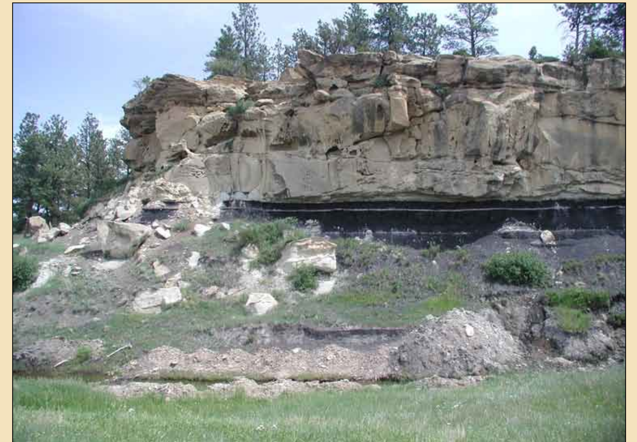
Bull Mountains natural outcrop of Mammoth Coal.