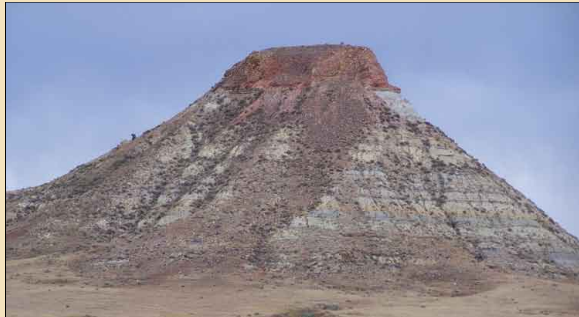
Clinker beds and burnt hill near Terry, Montana.

Scientists have determined that coal has been burning in eastern Montana for at least four million years, but each burning coal bed eventually extinguishes naturally. As the fire burns into the hill, the overlying rock breaks up and collapses, this allows air deeper into the hill and keeps the coal burning underground. Eventually, too much overlying rock collapses to allow air to enter, and the fire goes out.