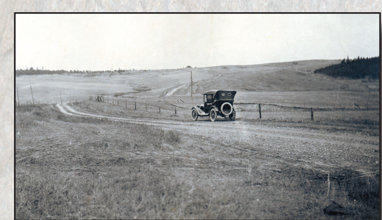
Fergus County 1922. Custer Battlefield Highway.

For centuries, the sandstone rimrocks along the Yellowstone River guided travelers between the mountains and the buffalo country to the east. In 1912, regional Good Roads enthusiasts and county officials created one of the first interstate highways in the United States, the Yellowstone Trail, an interconnected network of county roads blazed by distinctive chrome yellow signs with black arrows. The 4,000-mile highway connected Plymouth Rock, Massachusetts and Seattle, Washington with a branch to Yellowstone National Park. Later re-designated U.S. Highway 10, Interstate 90 bypassed it in 1971.