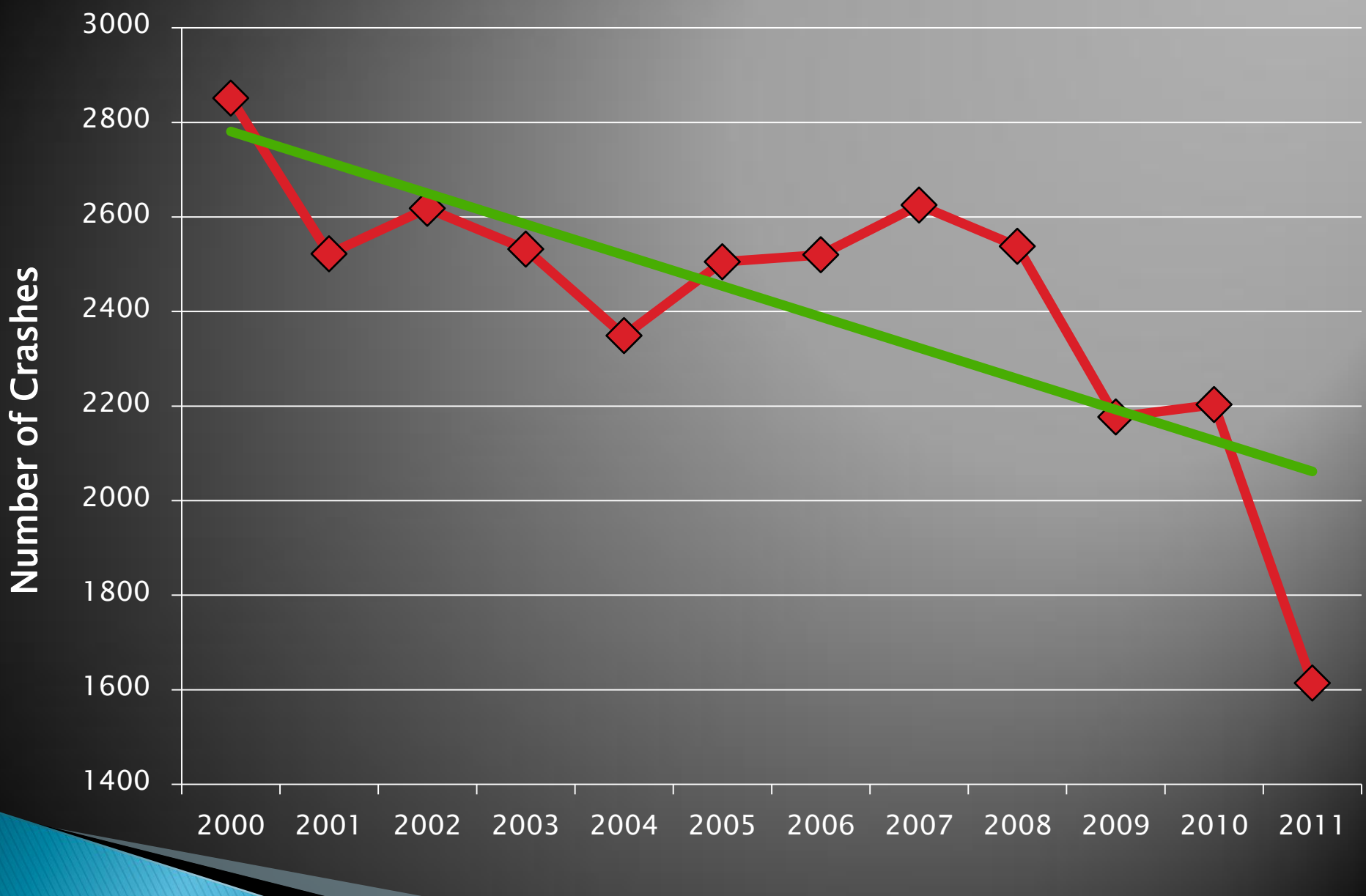
Large Vehicle Crashes