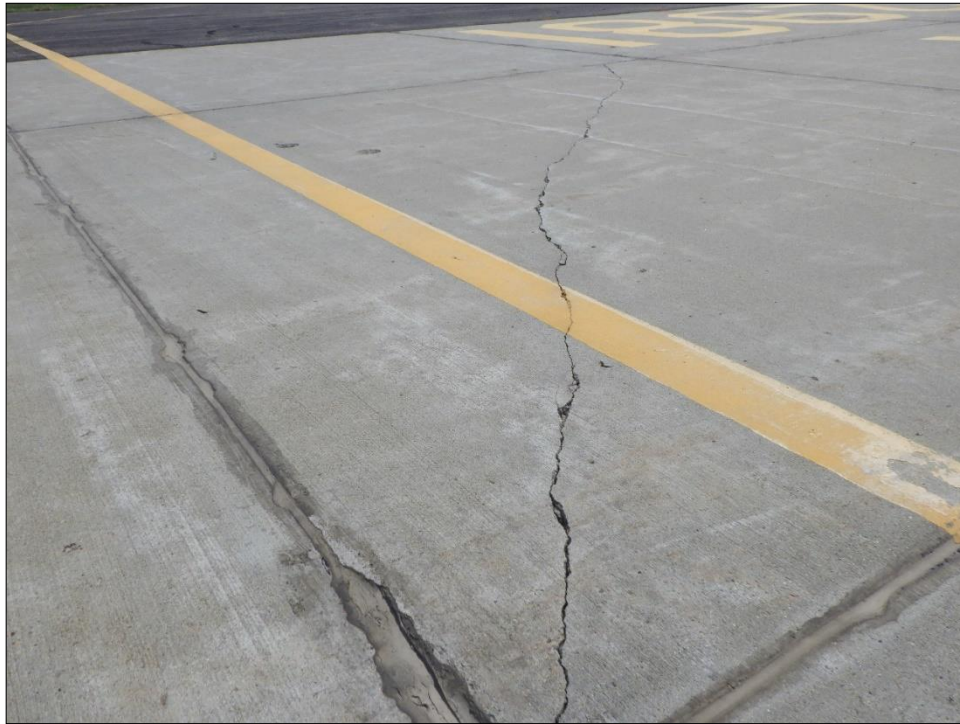
AP06-03: LTD Cracking