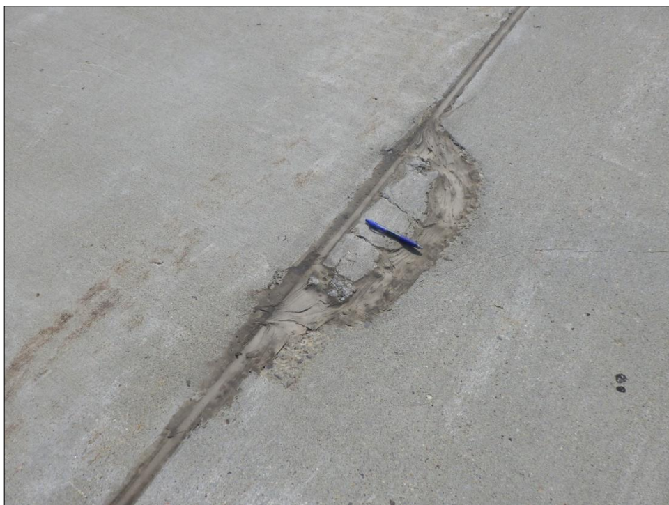
AP06-03: Joint Spalling