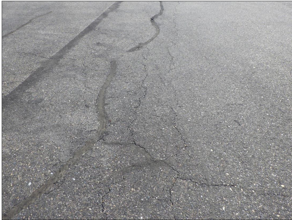
TW04-05: Alligator Cracking