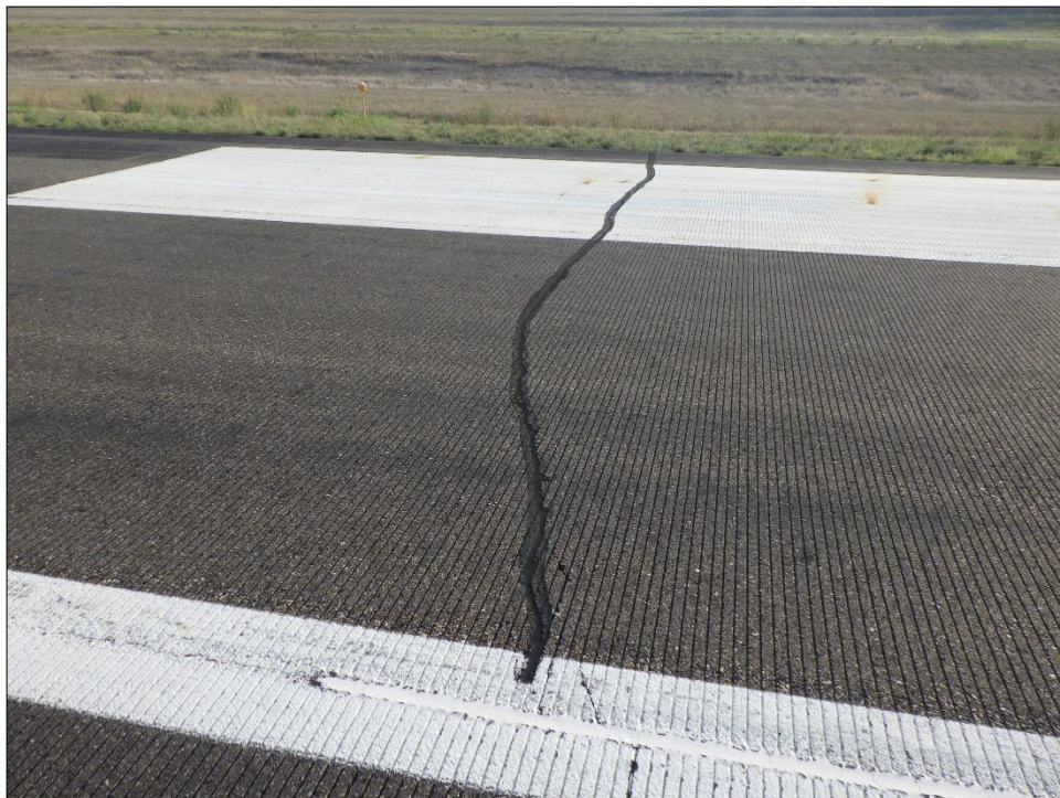
RW13-01-18: L&T Cracking