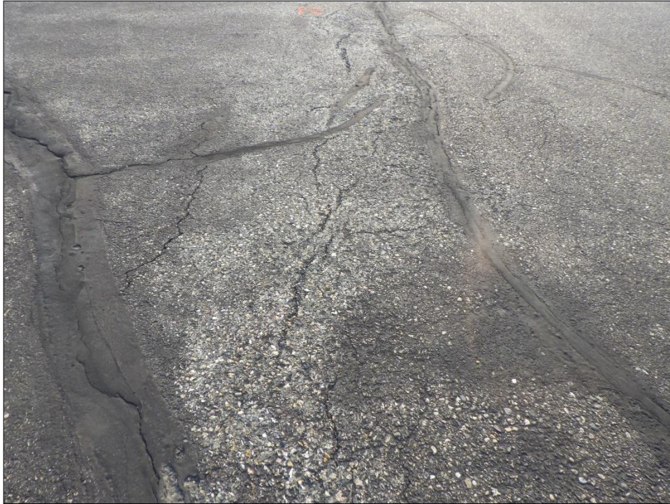
AP03A-01: L&T Cracking