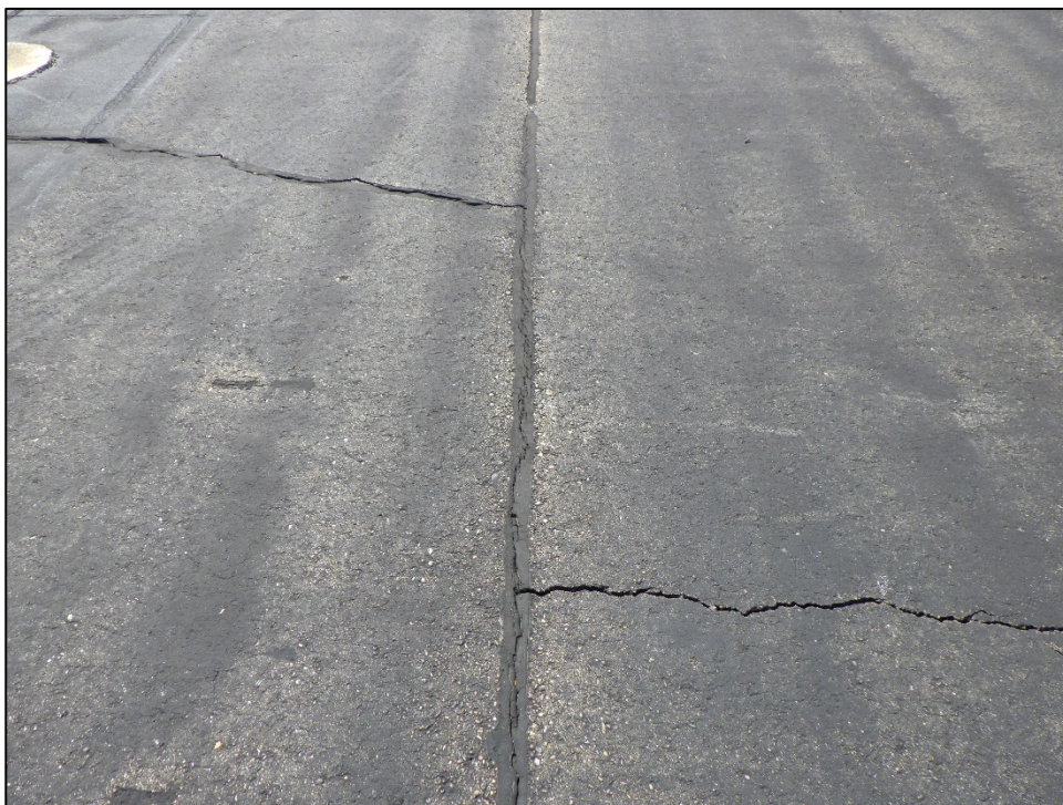
AP07-13: L&T Cracking