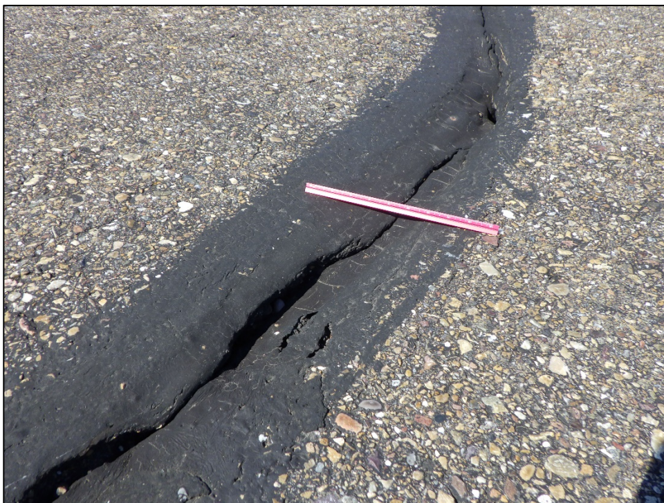
TW01-07: L&T Cracking