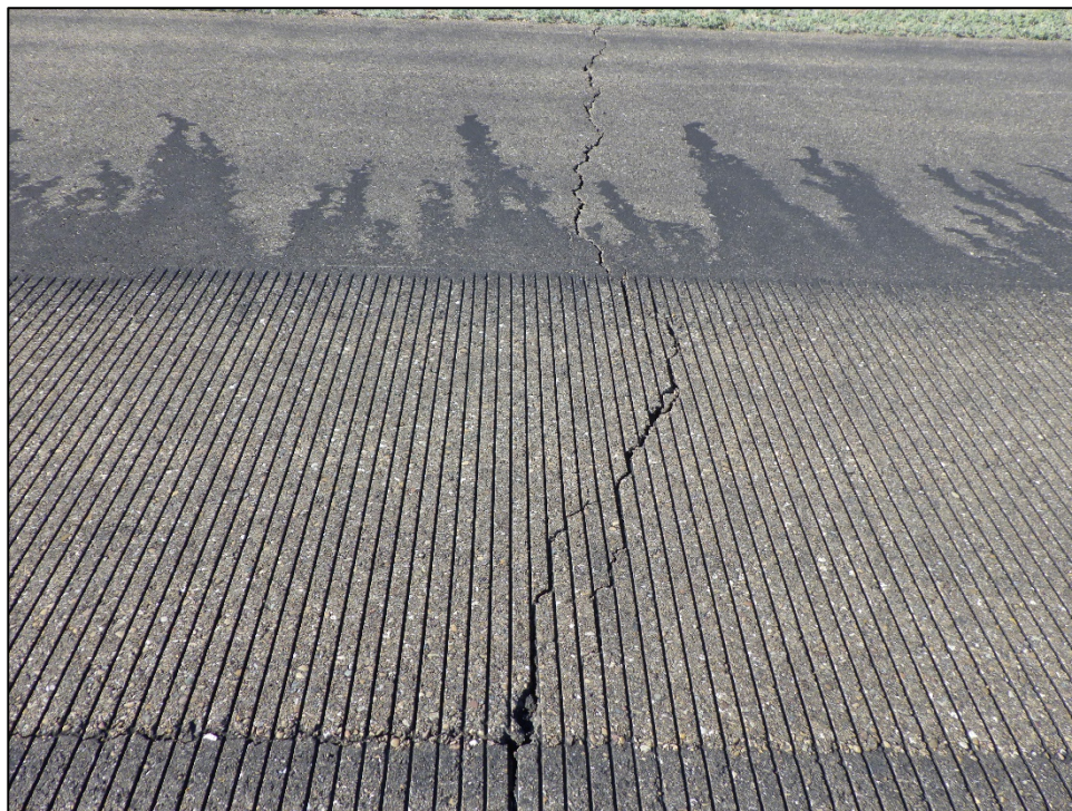
RW12-15: L&T Cracking