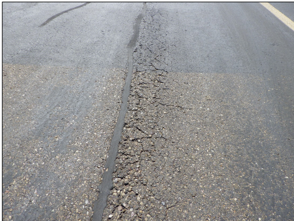
TW03-19: Alligator Cracking