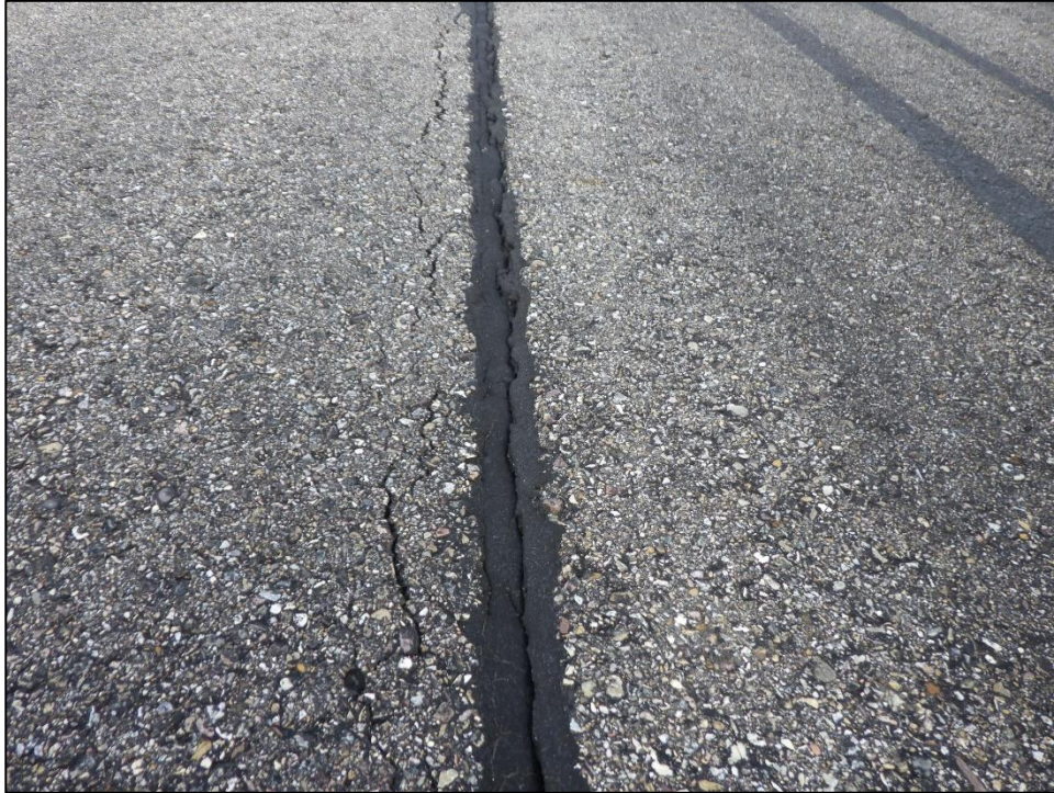
RW11-11-50: L&T Cracking