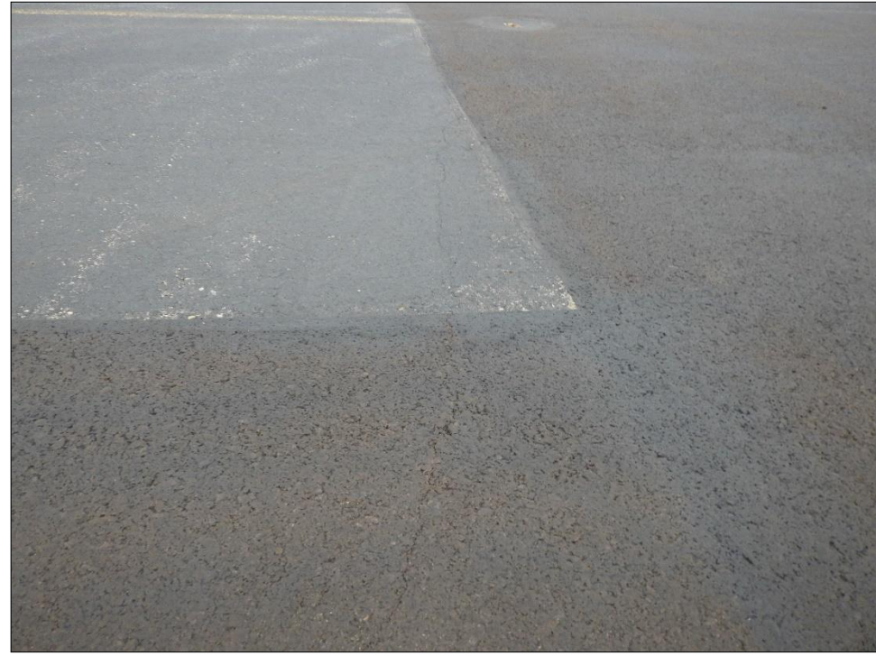
AP21-05: L&T Cracking