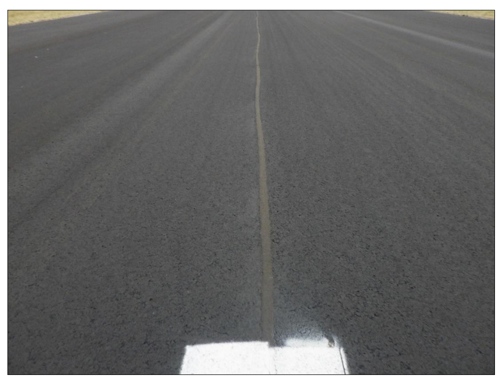
RW09-21-14: L&T Cracking