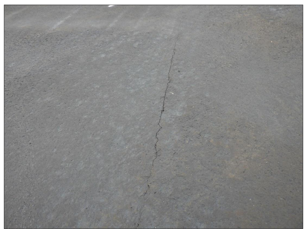
TW21-10: L&T Cracking