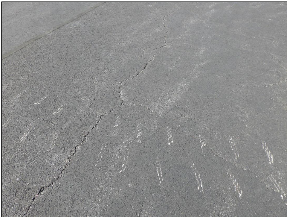
AP11-21: L&T Cracking