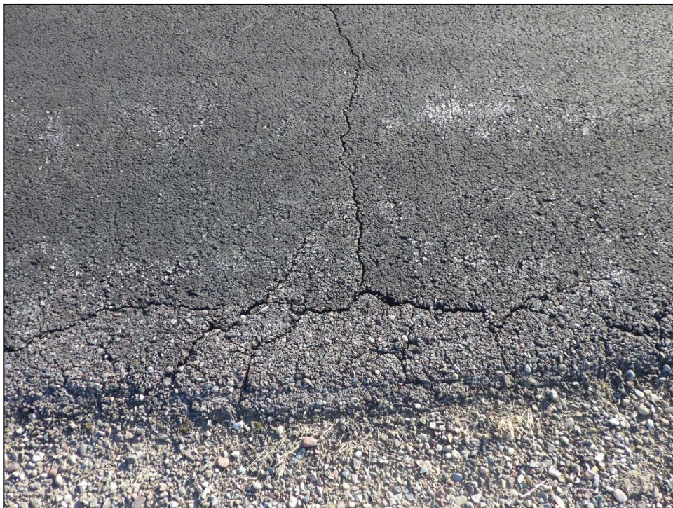
TW11-02: L&T Cracking