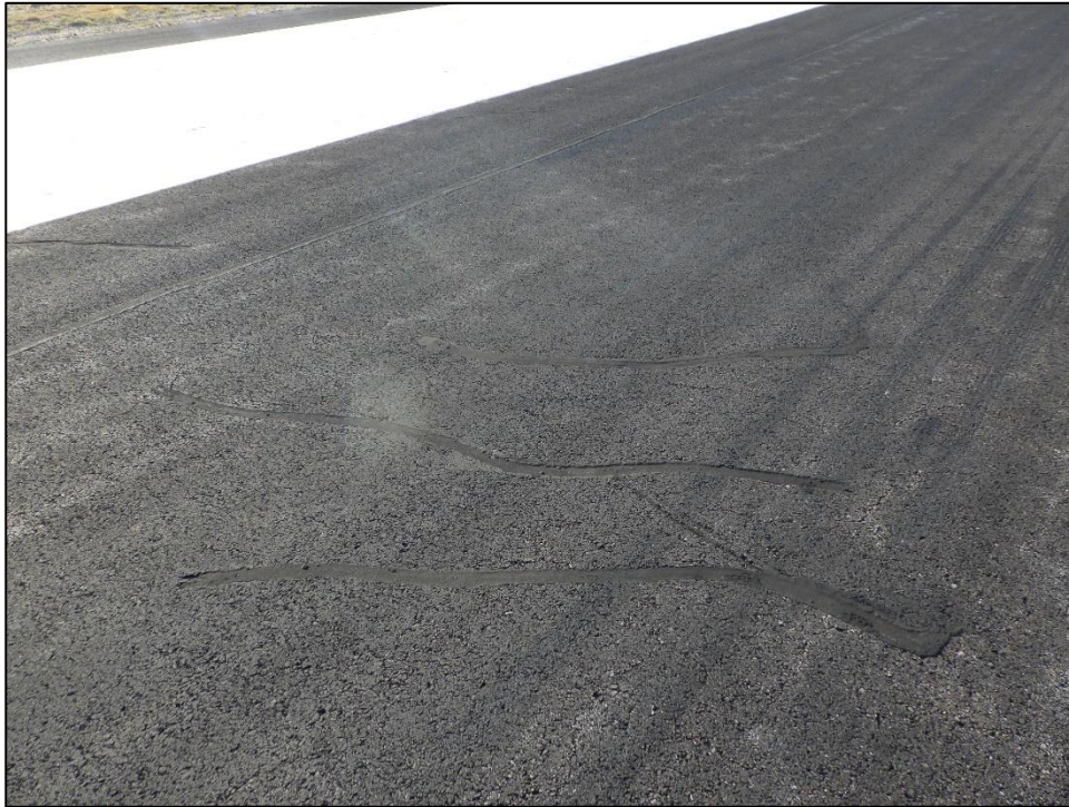
RW16-11-18: L&T Cracking