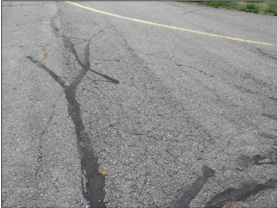
TW03-20: Alligator Cracking