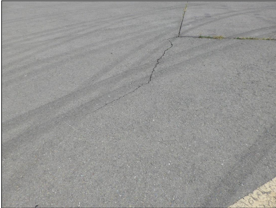
TW05-01: L&T Cracking