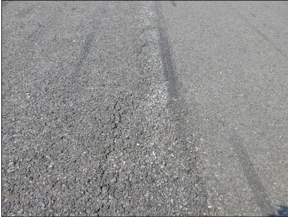
RW12-11-17: L&T Cracking