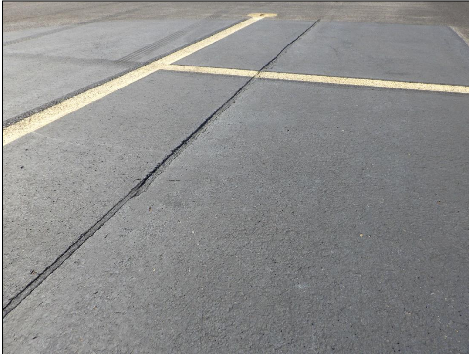
AP11-03: L&T Cracking