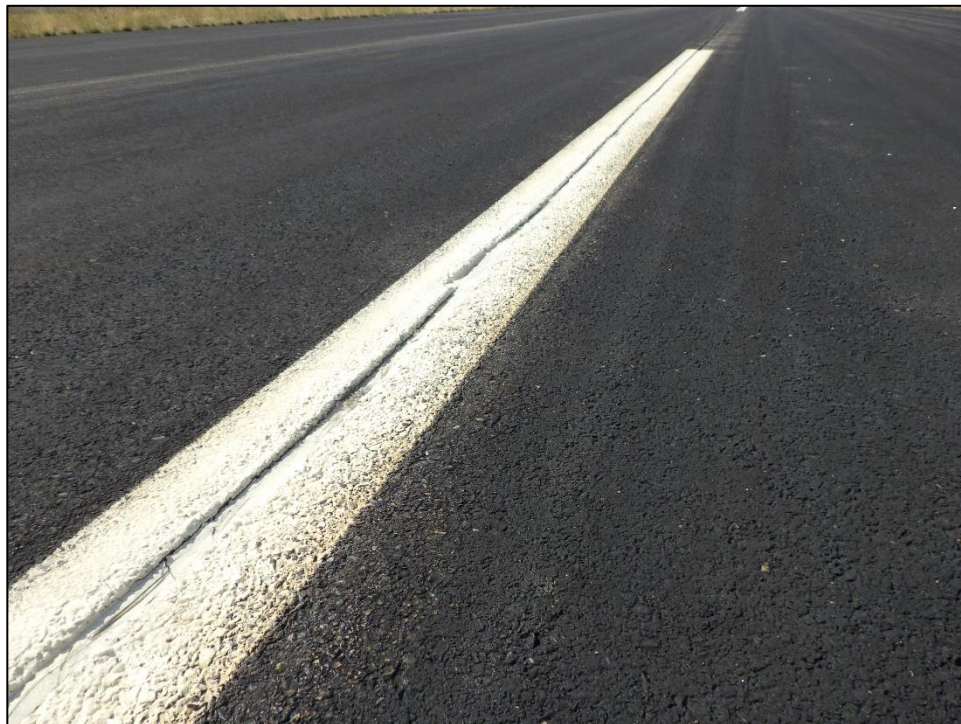
RW12-11-24: L&T Cracking