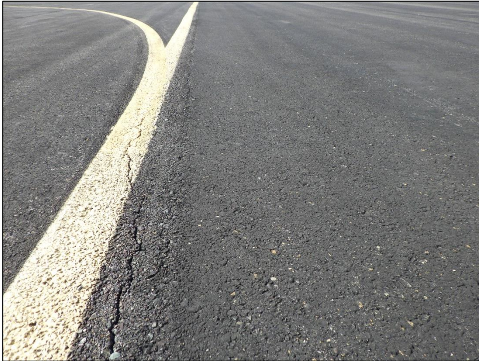
TW11-02: L&T Cracking