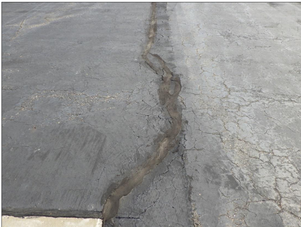
AP11-12: L&T Cracking