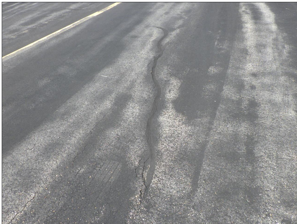
TW11-03: L&T Cracking