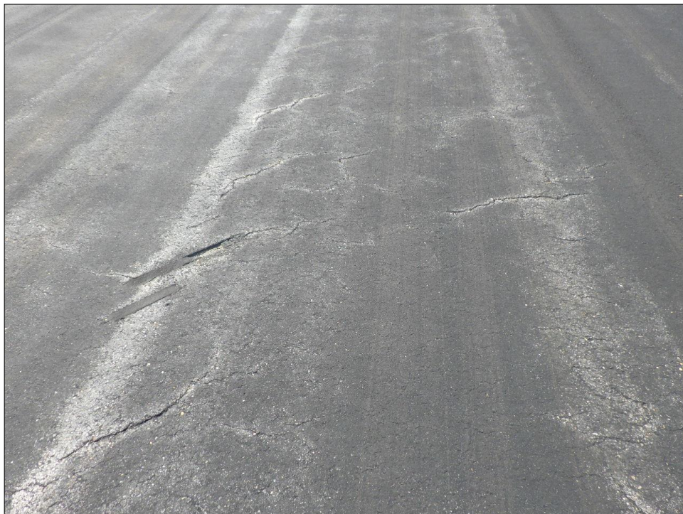
RW08-11-53: Slippage Cracking