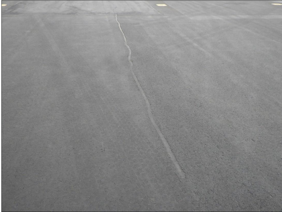
AP11-10: L&T Cracking