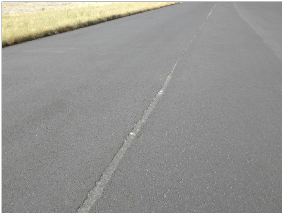
RW01-12-19: L&T Cracking