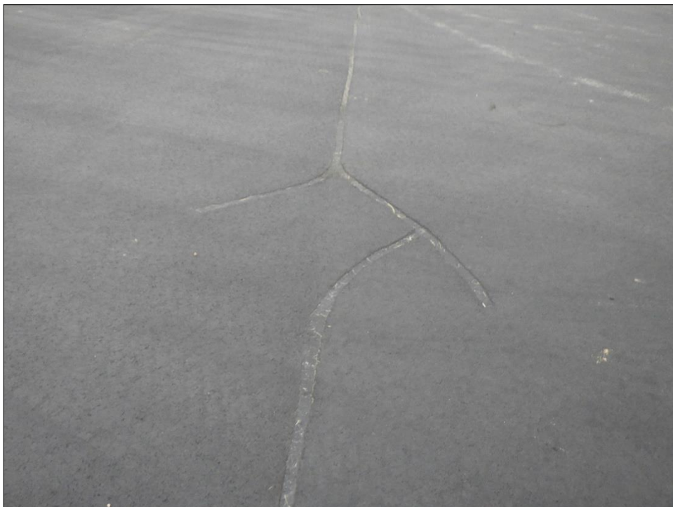
AP11-15: L&T Cracking