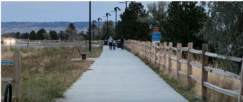
The recently improved Skyline Trail and Zimmerman Park draw many multimodal users to the trail system along the corridor.