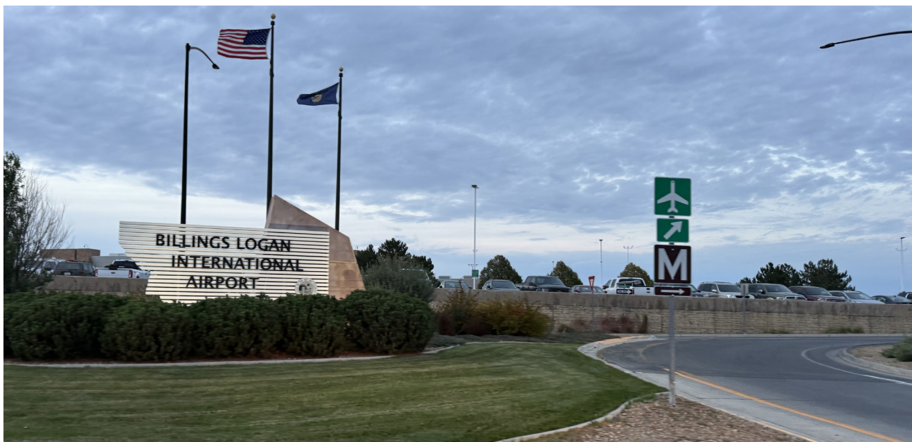
Airport traffic regularly passes through the corridor.