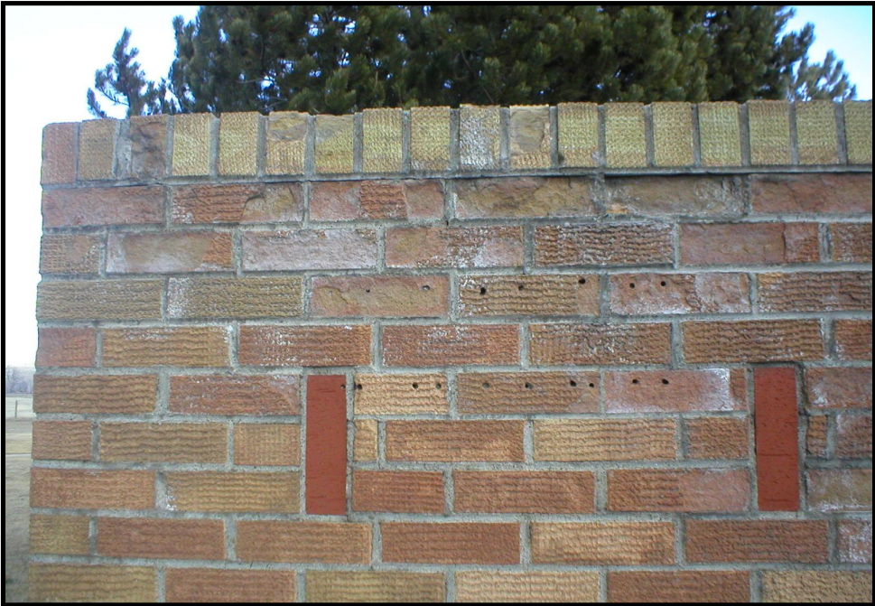
Photo 3. Crumbling brick at Greycliff WB site.