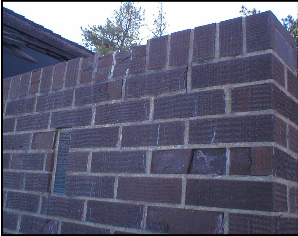
Photo 7. Crumbling brick at Custer EB site.