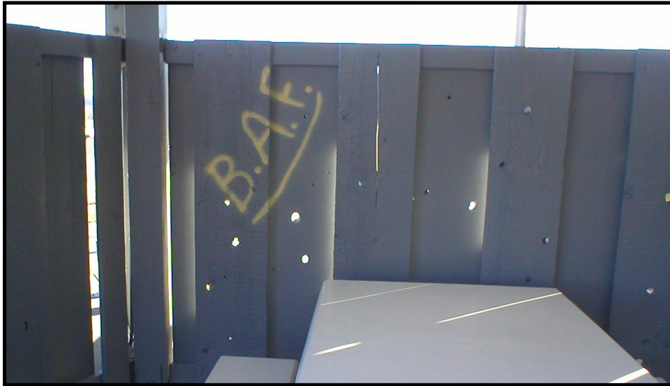
Photo 1. Graffiti near Greycliff EB picnic table.