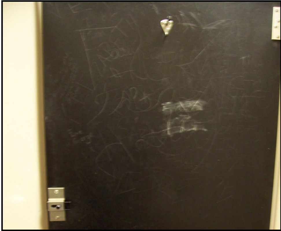
Photo 13. Graffiti on door of women's stall at Hysham WB site.