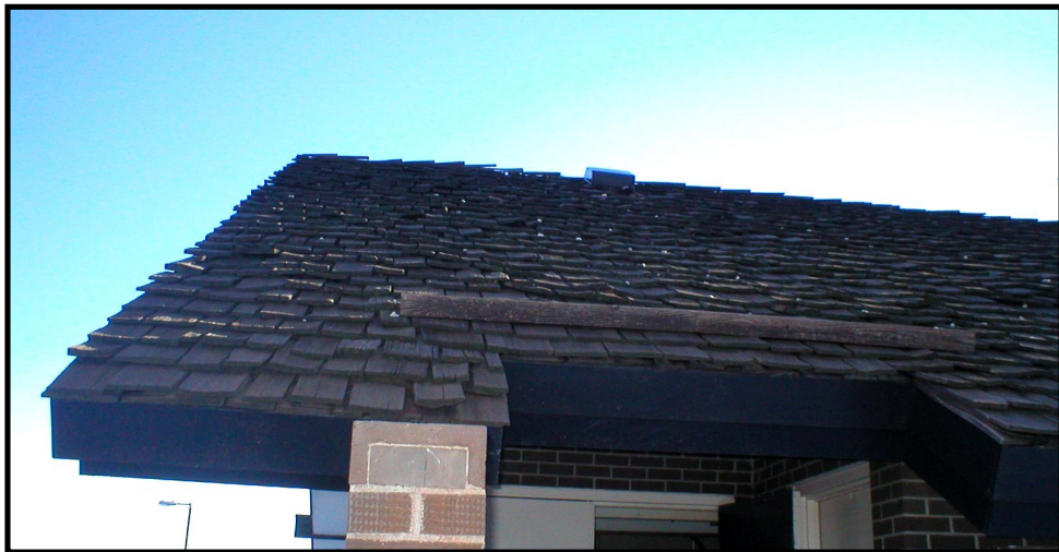
Photo 6. Cedar shake roof at Custer EB site in need of repair / replacement.