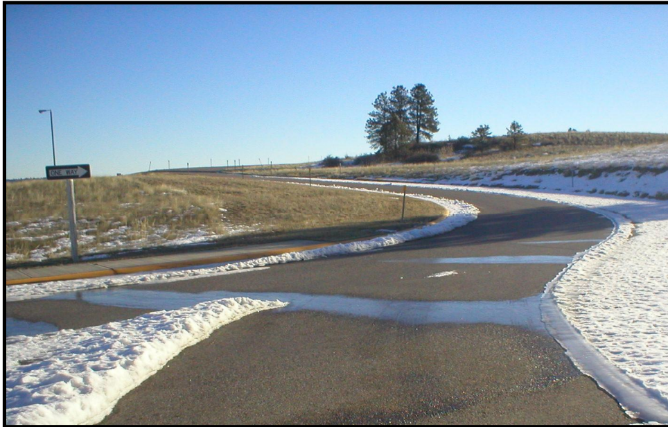
Photo 9. Acceleration ramp at Custer WB site.