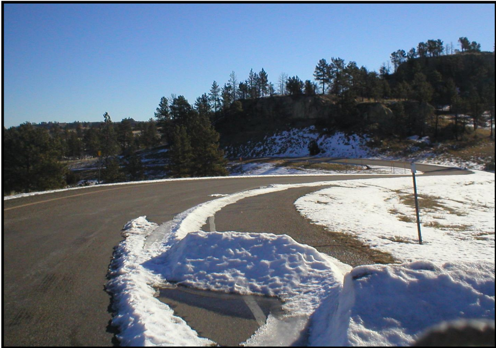
Photo 8. Acceleration ramp at Custer EB site.