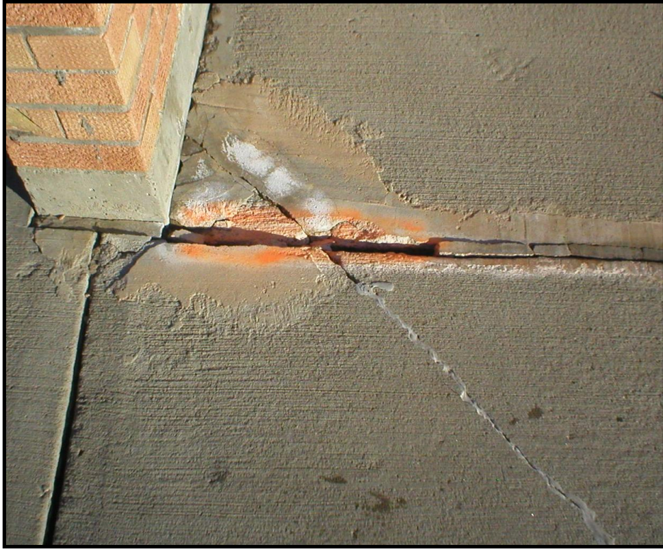
Photo 15. Cracked sidewalk at Hathaway EB site.