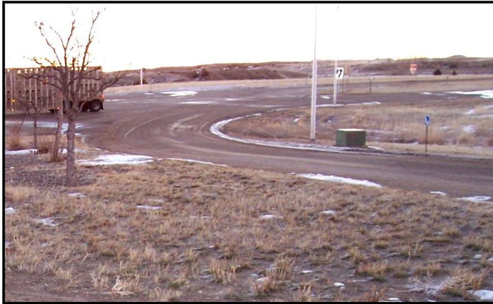
Photo 18. Acceleration ramp at Hathaway WB site.