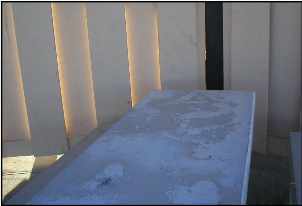
Photo 16. Chipping paint on picnic table at Hathaway EB site.