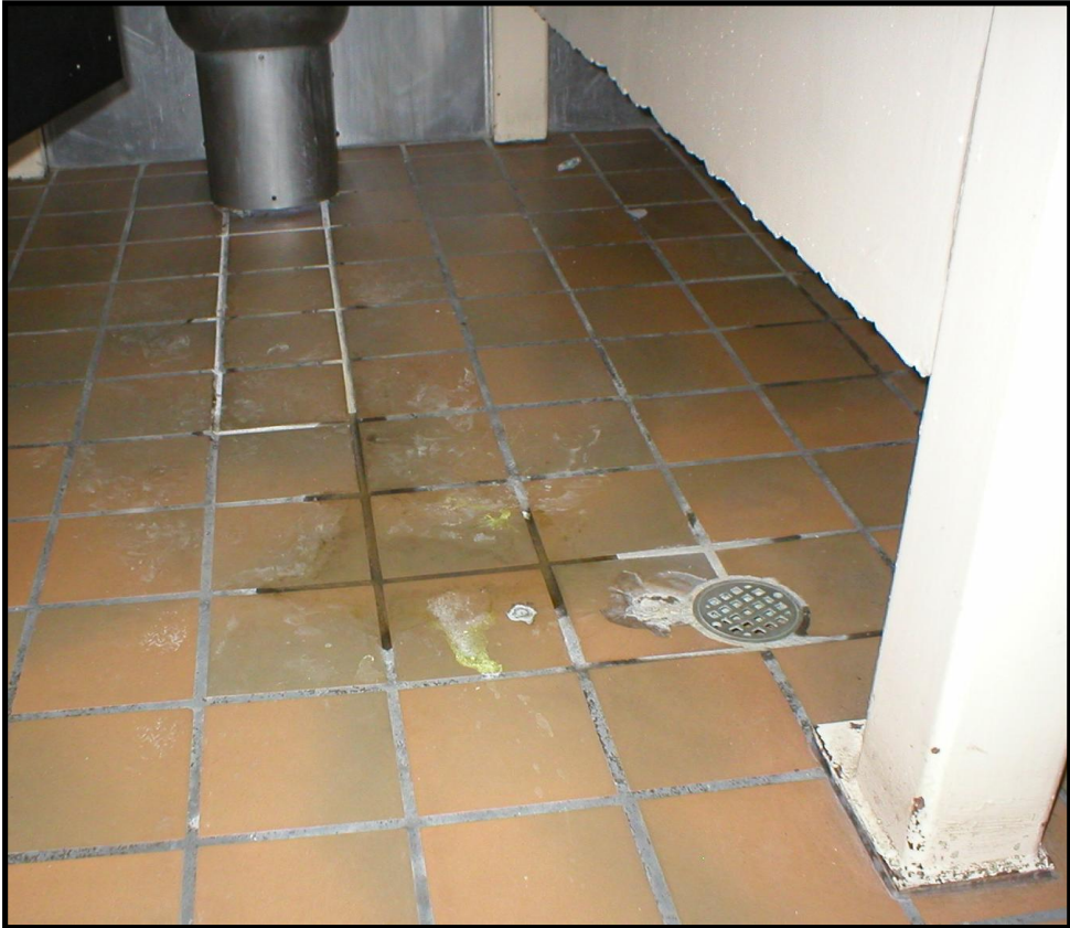
Photo 4. Crumbling floor tile in women's restroom at Greycliff WB site.