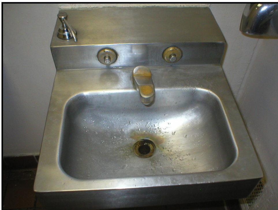
Photo 10. Rusted sink at Hysham EB site.