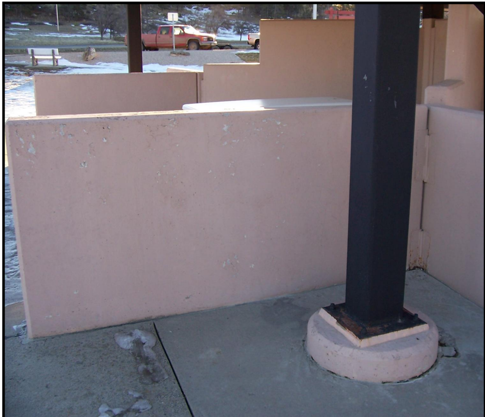
Photo 14. Chipped paint near picnic tables at Hysham WB site.