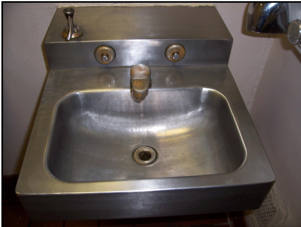
Photo 12. Rusted sink at Hysham WB site.