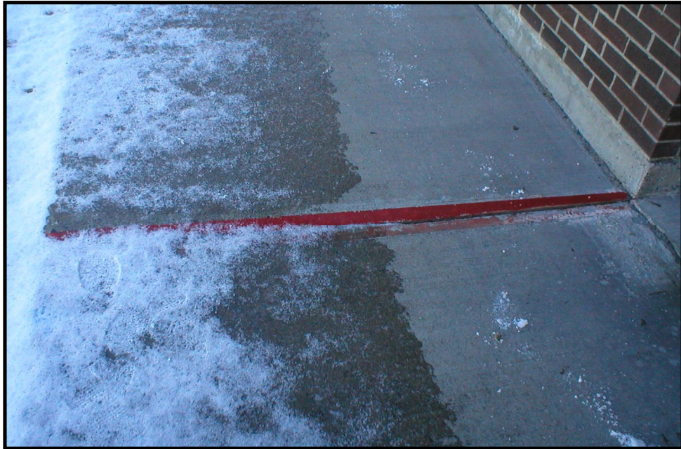
Photo 5. Uneven sidewalk at Custer EB site.