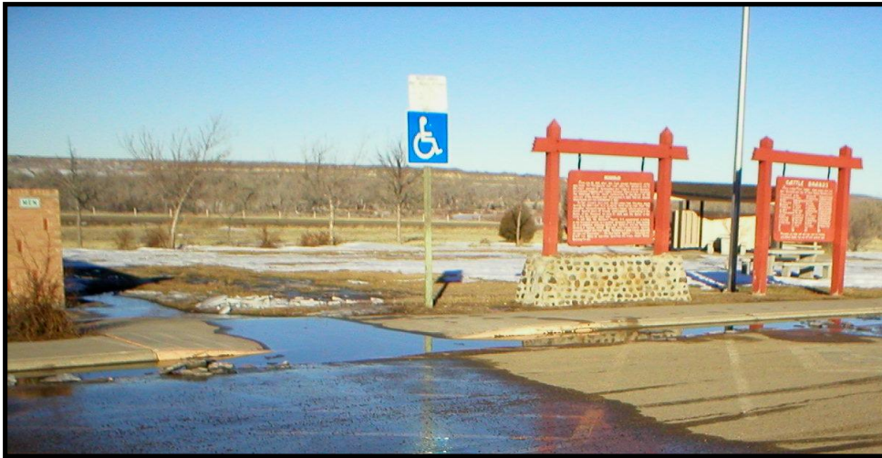
Photo 17. Drainage issues at Hathaway EB site. Melting snow is flooding sidewalk area.