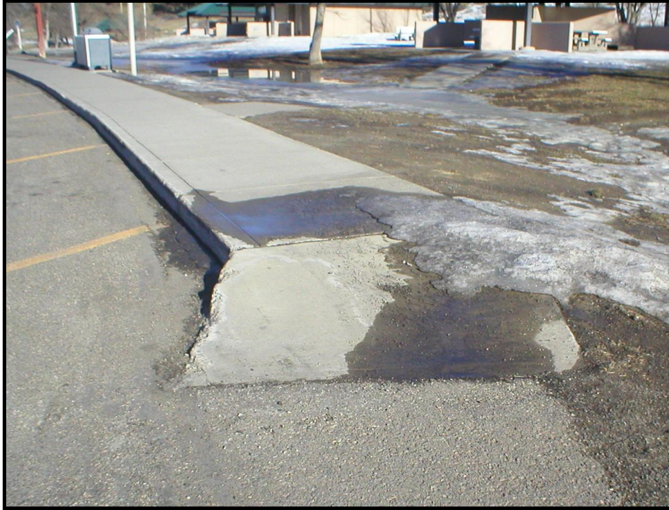
Photo 11. Crumbling ramp at Hysham EB site.