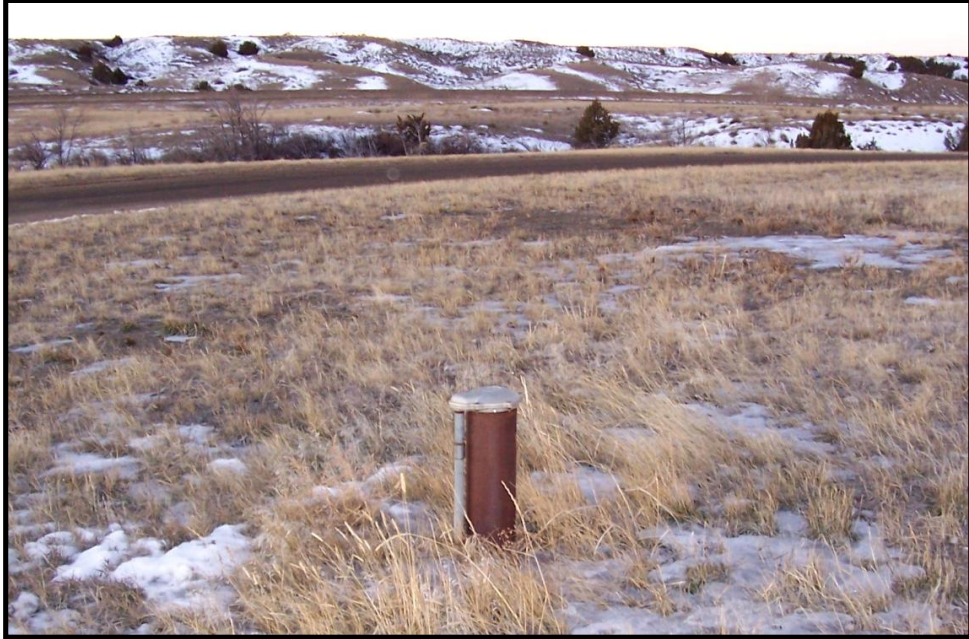
Photo 45. Well head for Hathaway WB.