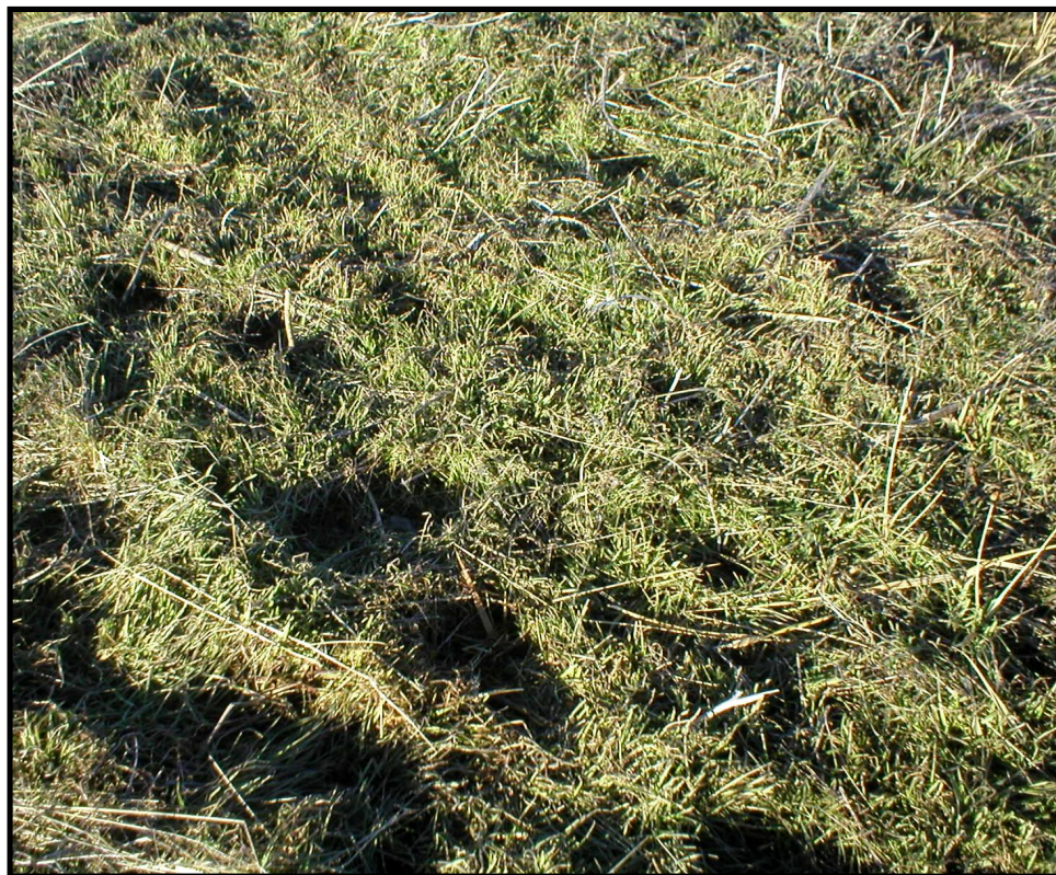
Photo 37. Green grass over drain field for Hathaway EB.