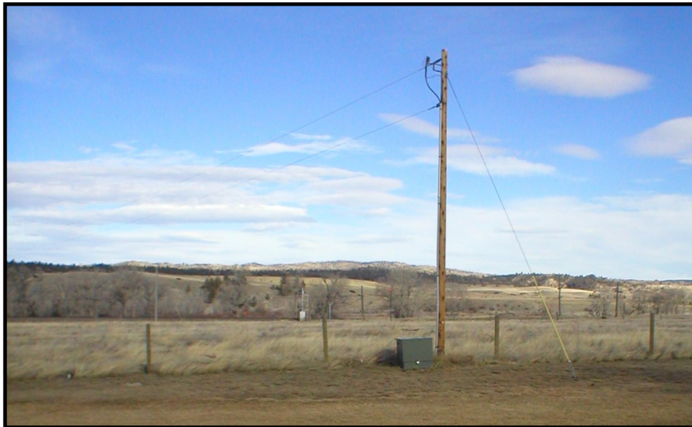
Photo 7. Power source for Greycliff WB.