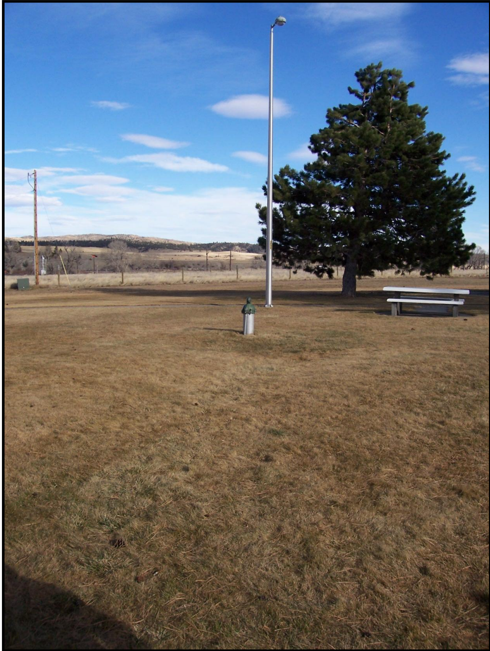
Photo 12. Greycliff WB well head.