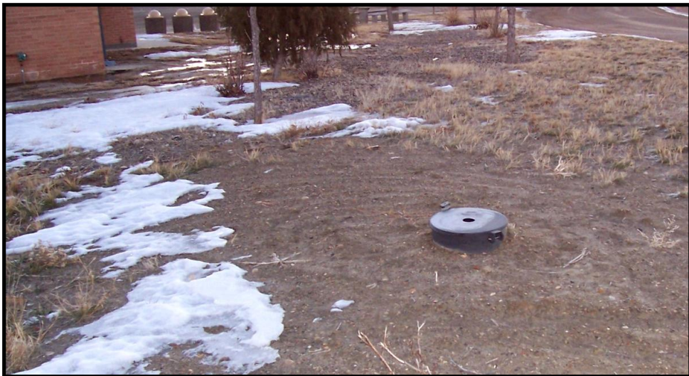
Photo 46. Underground propane tank for Hathaway WB.