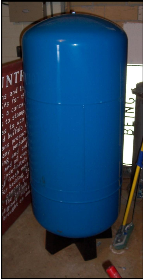
Photo 22. Pressure Tank at Custer WB.