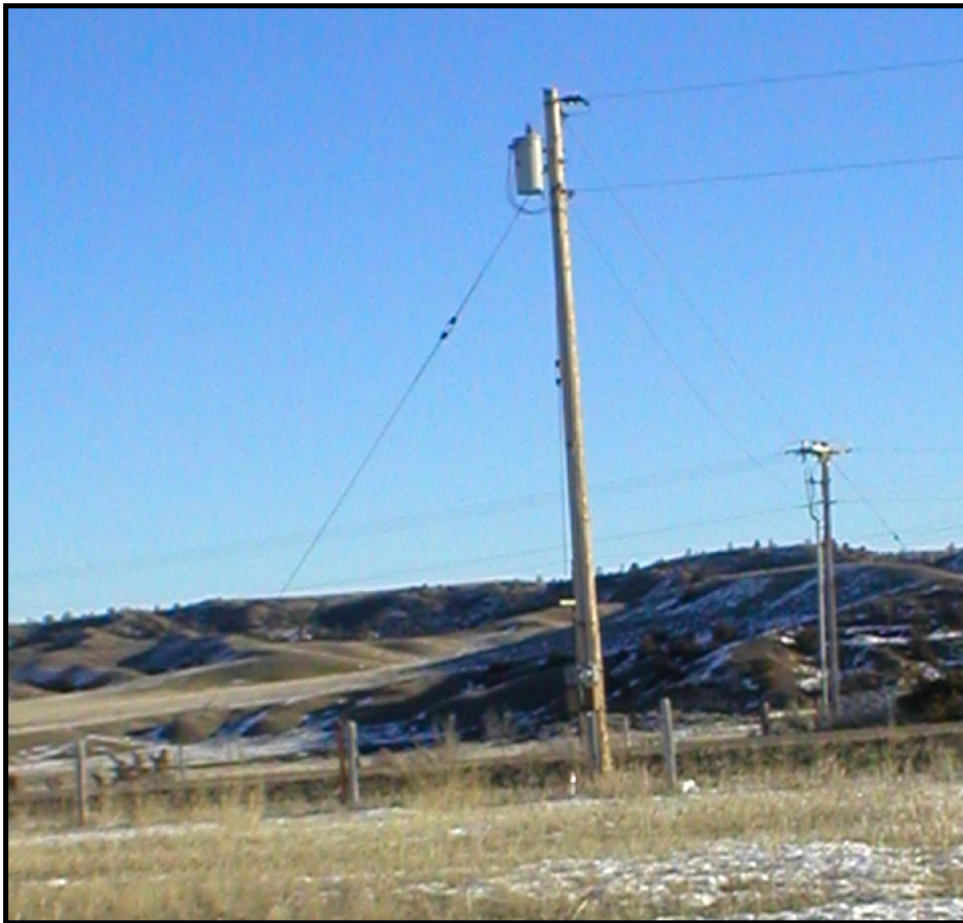
Photo 34. Power source for Hathaway EB.