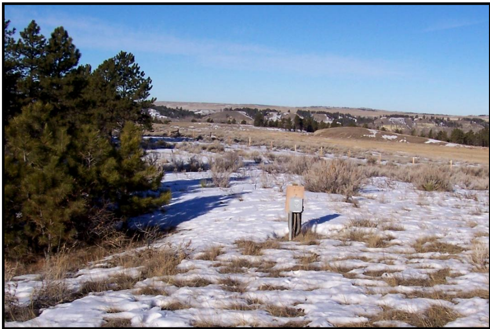
Photo 20. Well head for Custer WB.