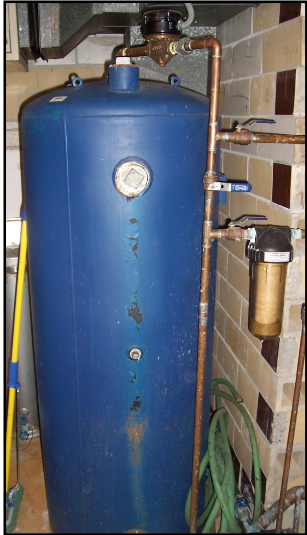
Photo 23. Pressure Tank at Custer WB.