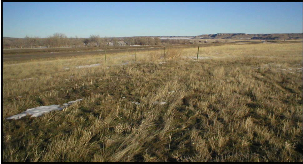
Photo 38. Sewer drain field location and markings for Hathaway EB.