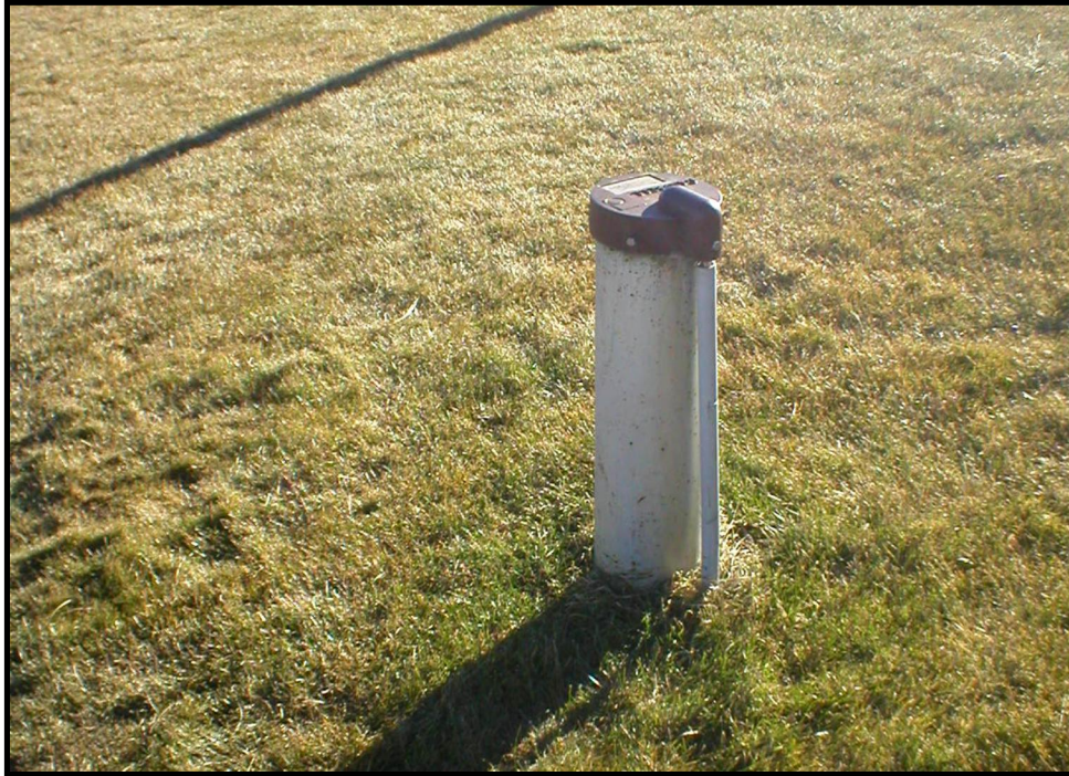
Photo 1. Old Greycliff EB well head.