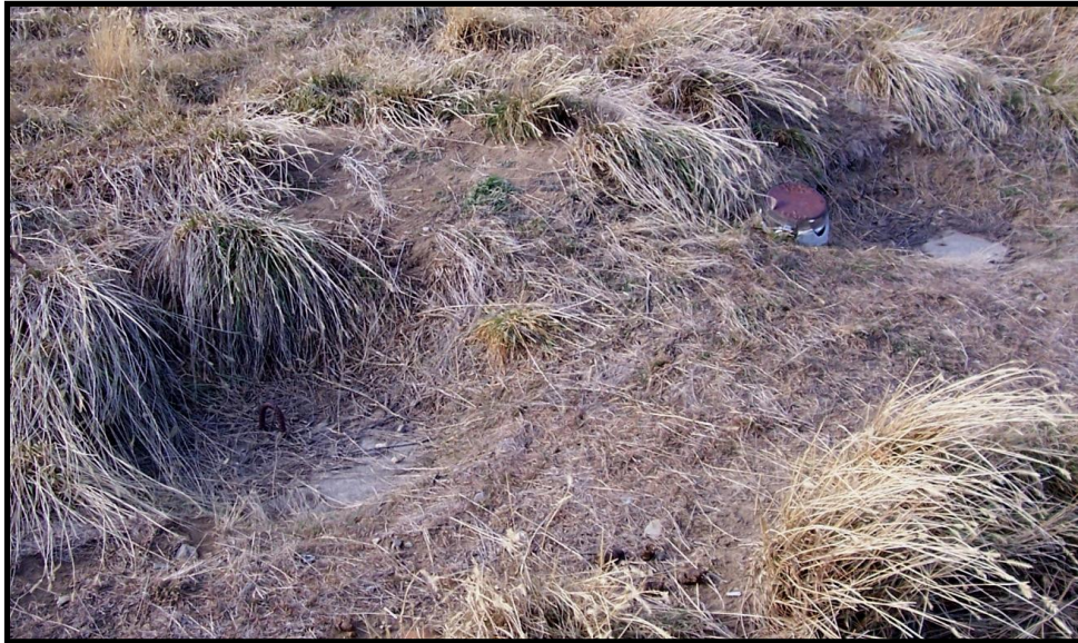
Photo 14. Septic Tank