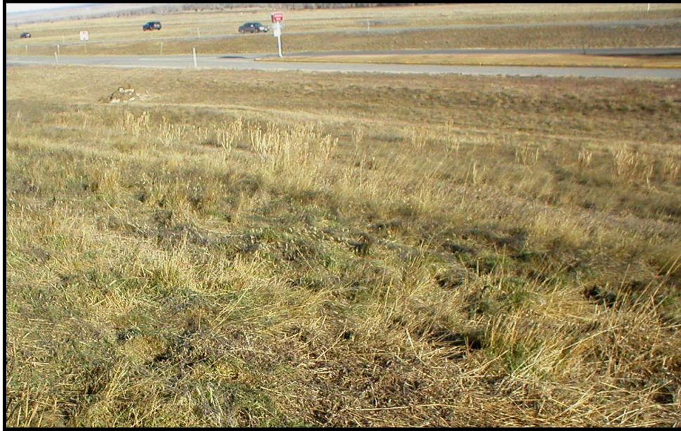
Photo 4. Looking north the Greycliff EB sewer drain field.