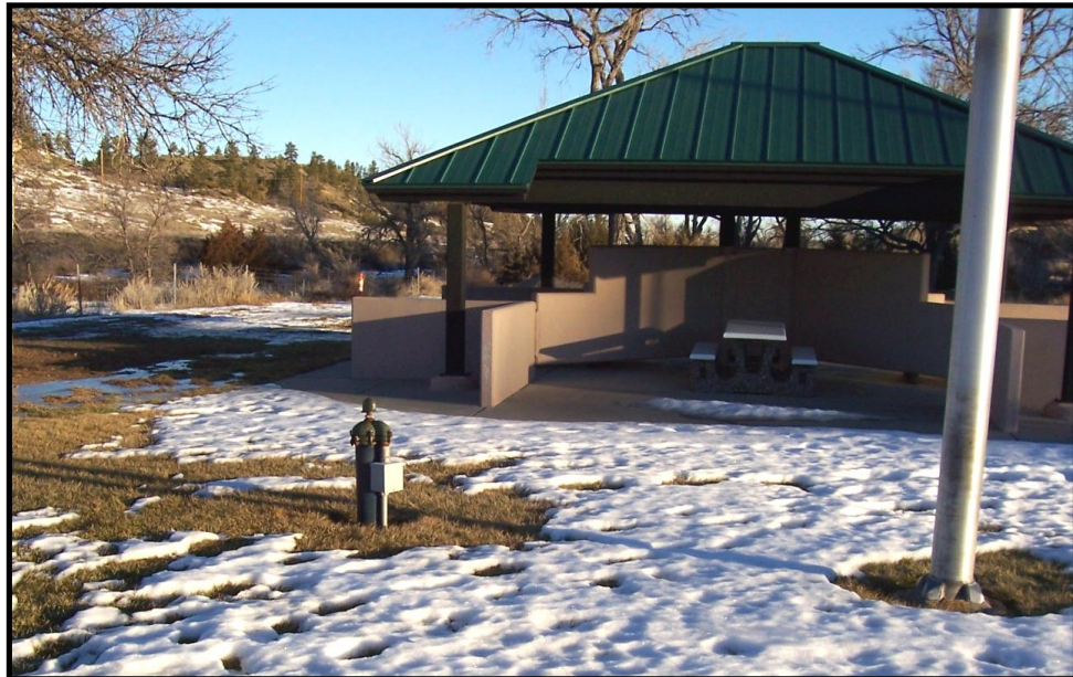
Photo 31. Hysham WB well head.