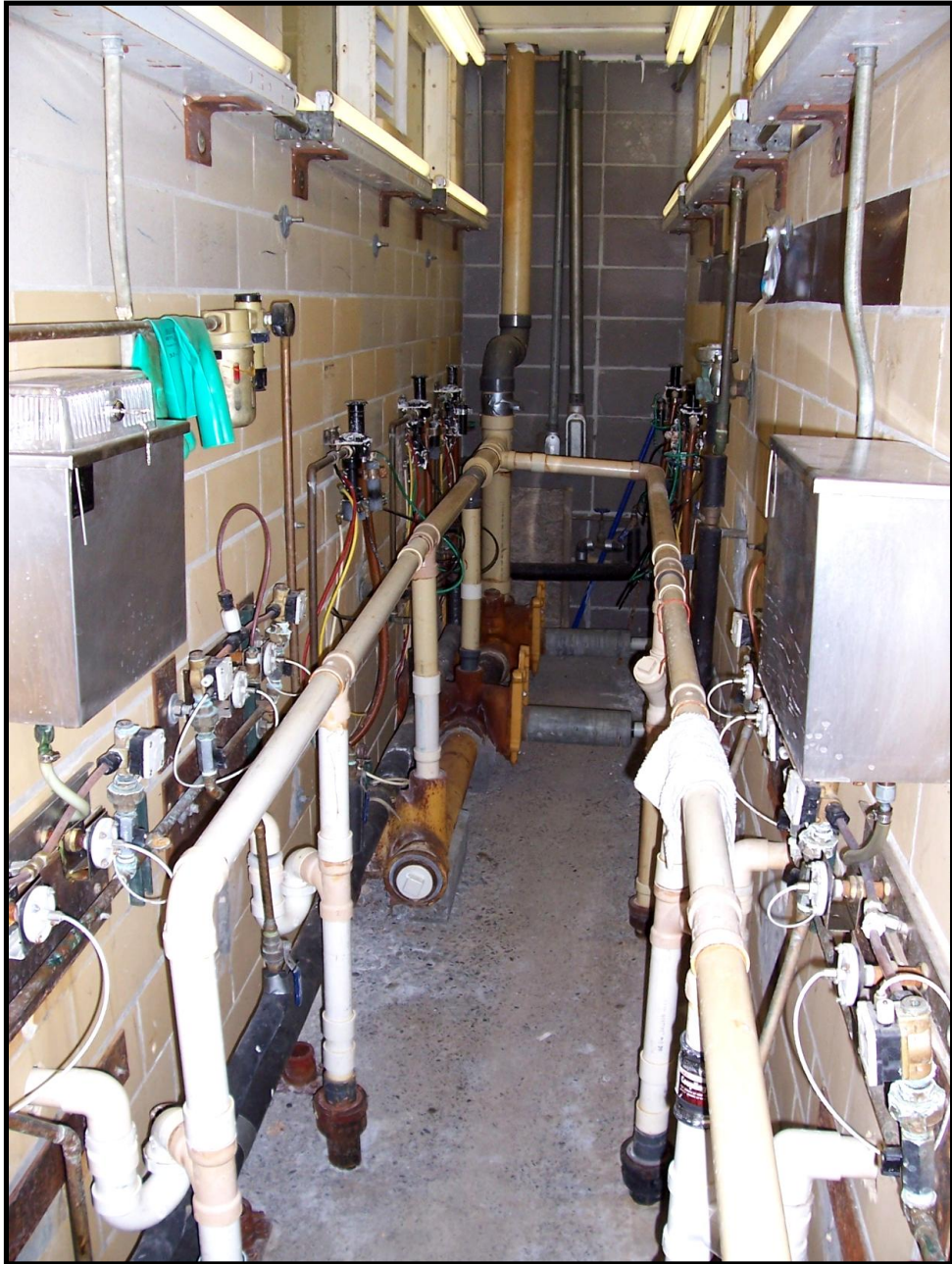
Photo 17. Water and Sewer Plumbing for Custer EB