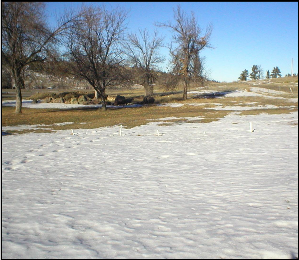
Photo 24. Sewer drain field location and markings for Hysham EB.