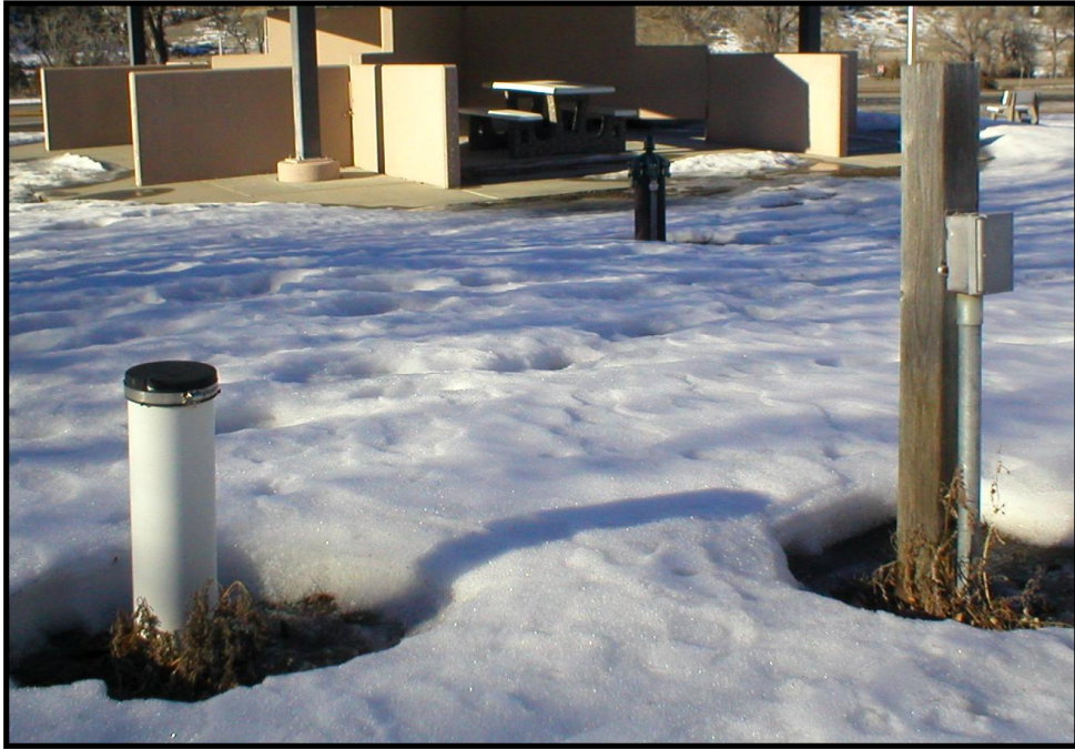
Photo 27. Hysham EB power outlet for dosing pumps. Well head in background.