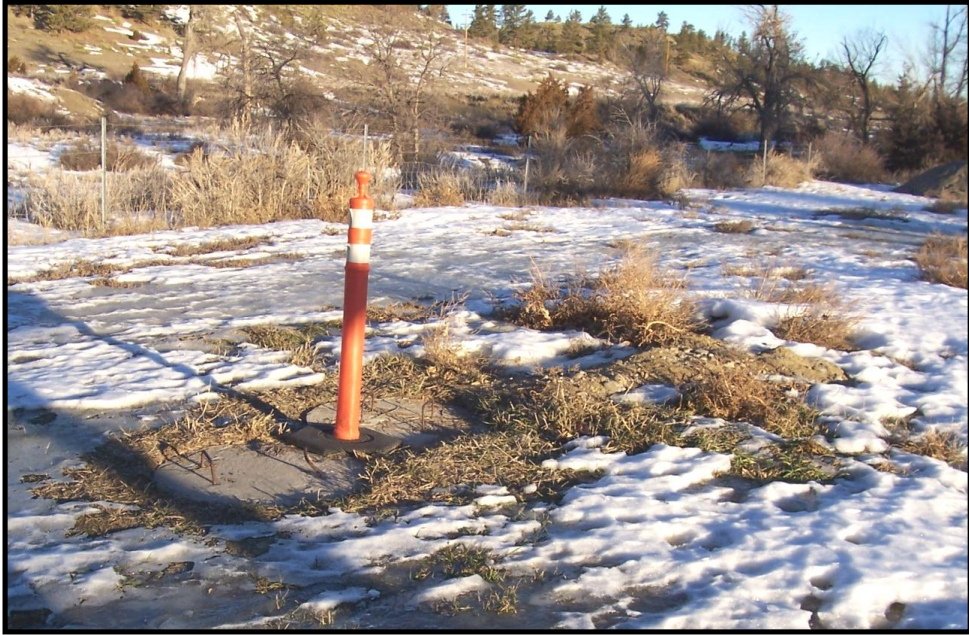
Photo 32. Septic tank for Hysham WB.