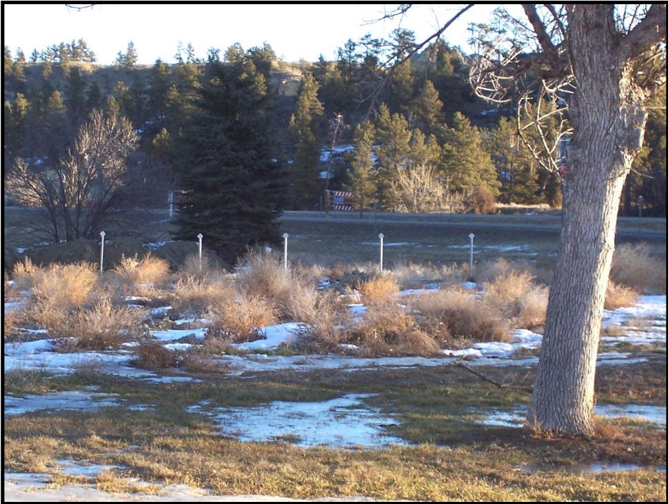
Photo 33. Sewer drain field location and markings for Hysham WB.