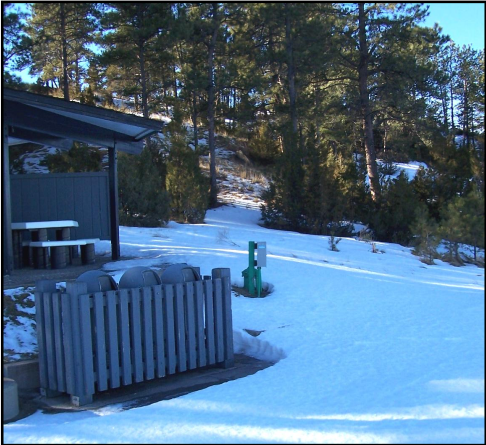
Photo 15. Well head for Custer EB.