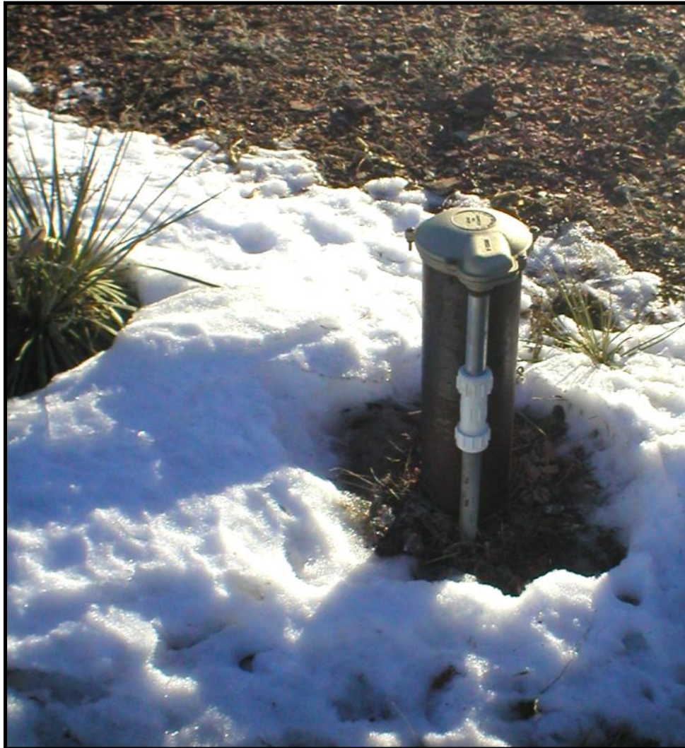
Photo 39. Well head for Hathaway EB.