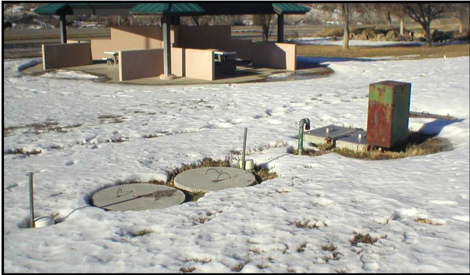
Photo 28. Septic tank and dosing chamber for Hysham EB.