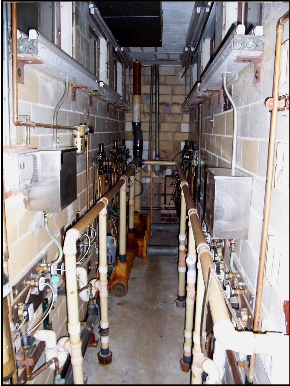
Photo 21. Water and Sewer Plumbing for Custer WB.