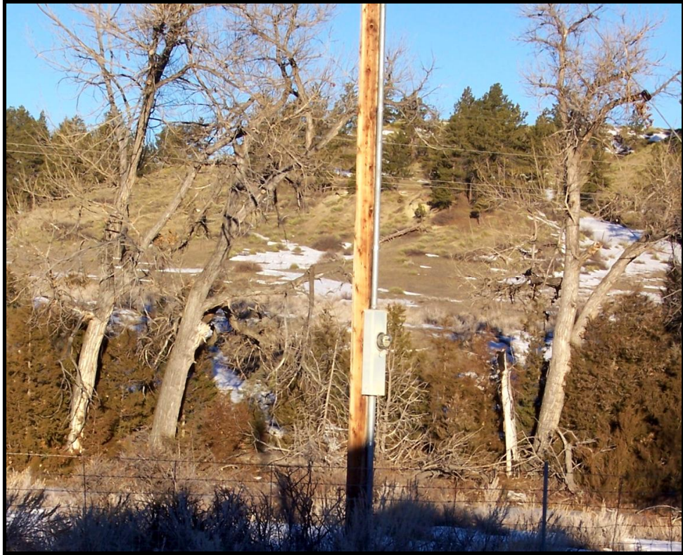
Photo 30. Power supply for Hysham WB.