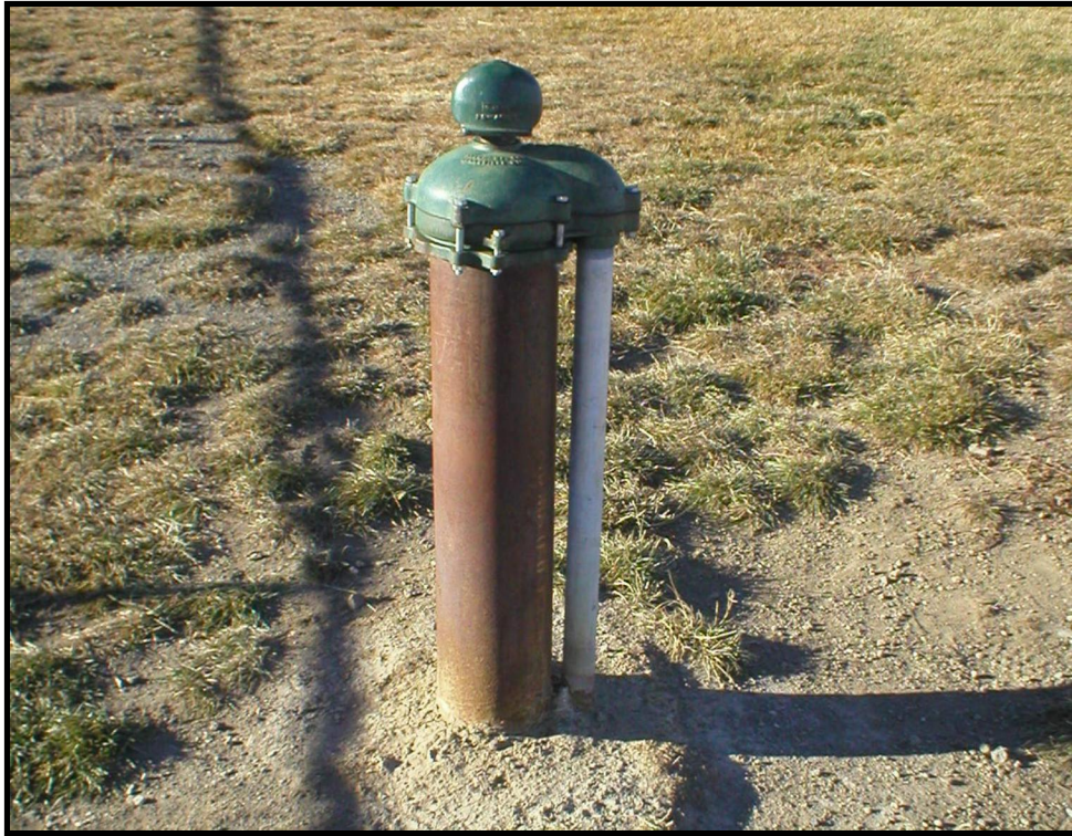
Photo 6. New Greycliff EB well head.