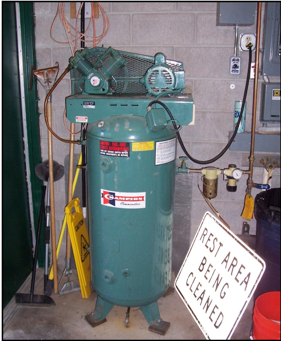
Photo 11. Air Tank