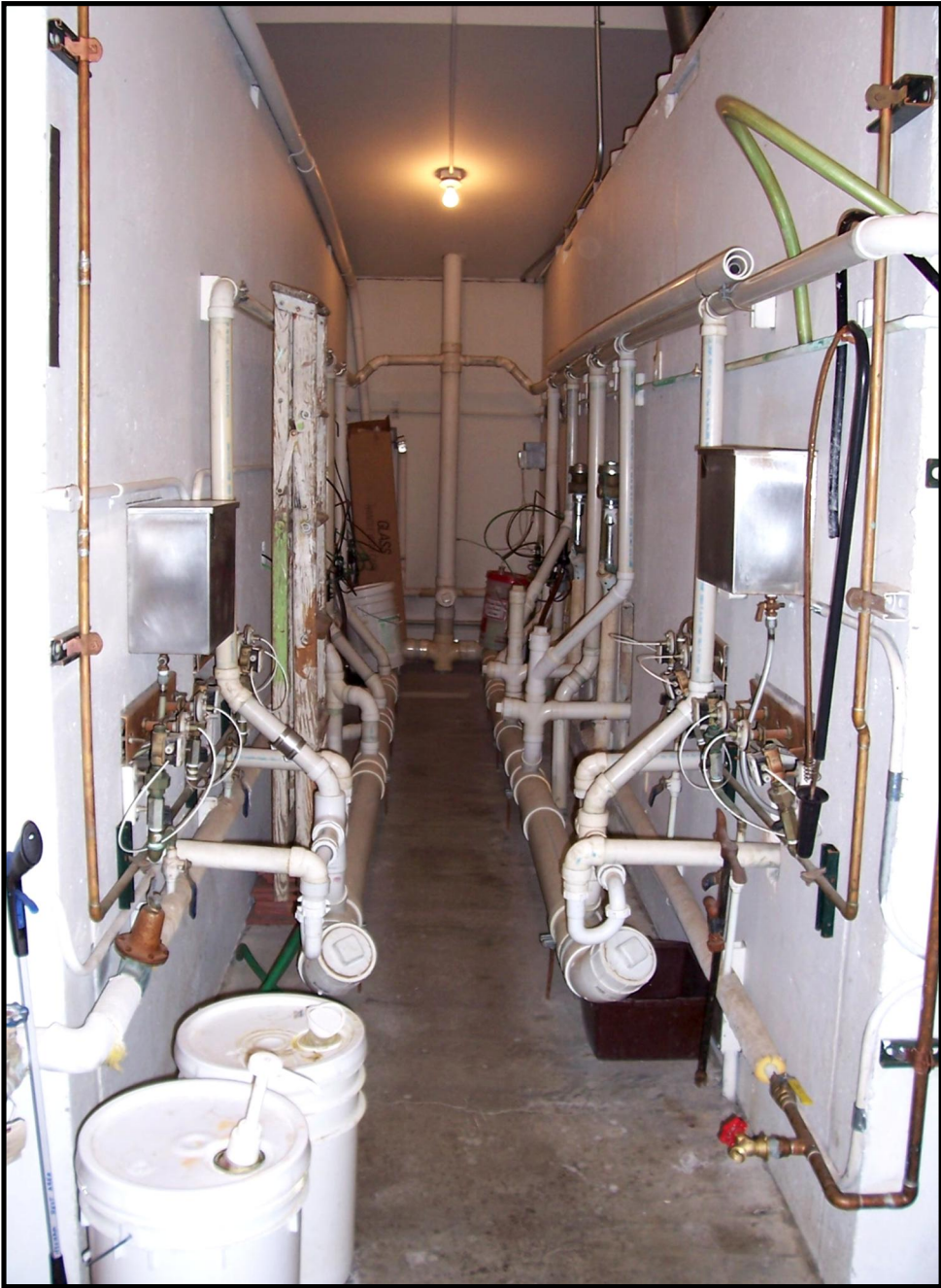
Photo 29. Water and Sewer Plumbing for Hysham WB.