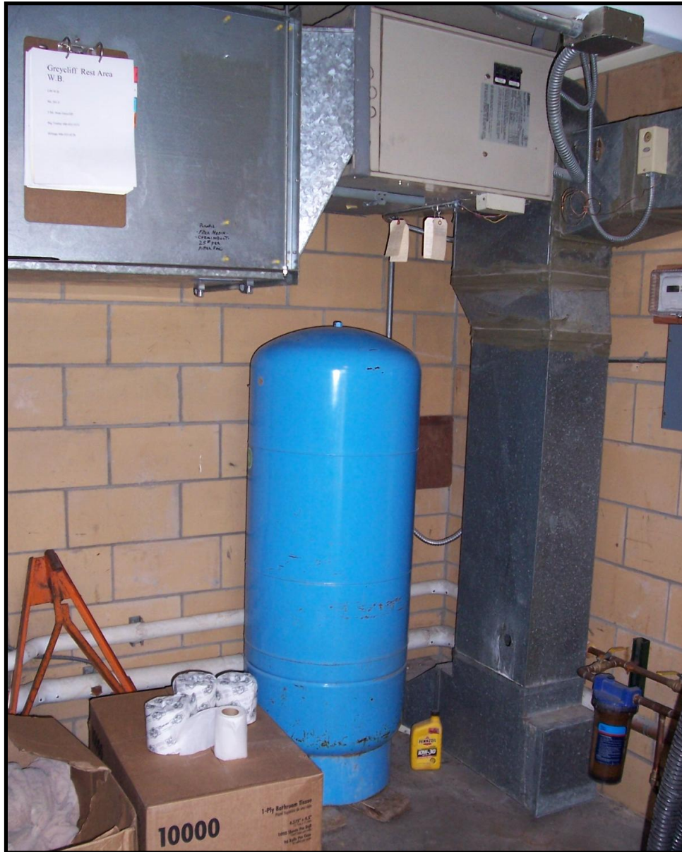
Photo 8. Pressure Tank