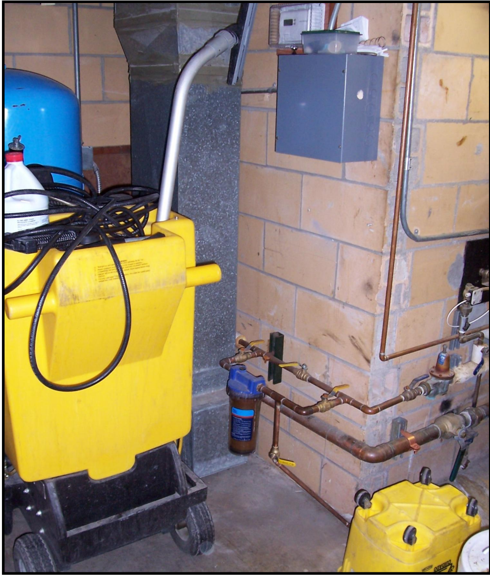
Photo 9. Cartridge Filter