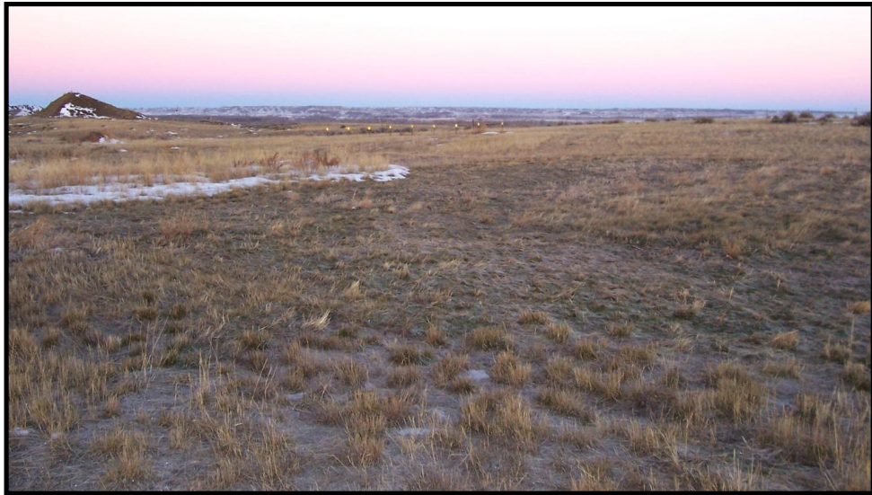
Photo 44. Sewer drain field location and markings for Hathaway WB.