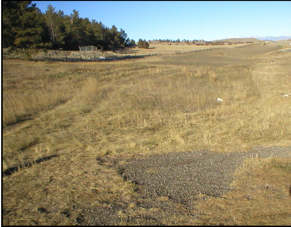
Photo 2. Sewer drain field at west edge of Greycliff EB site.