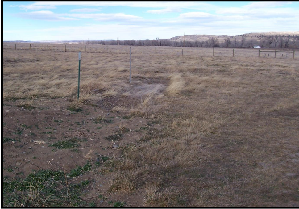
Photo 13. Sewer drain field location and markings for Greycliff WB.