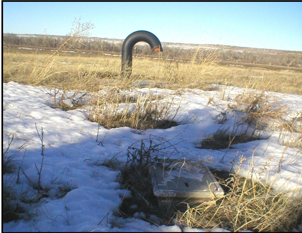
Photo 36. Septic tank at Hathaway EB.