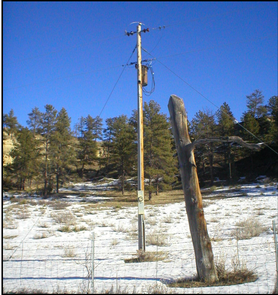
Photo 25. Power source for Hysham EB site.