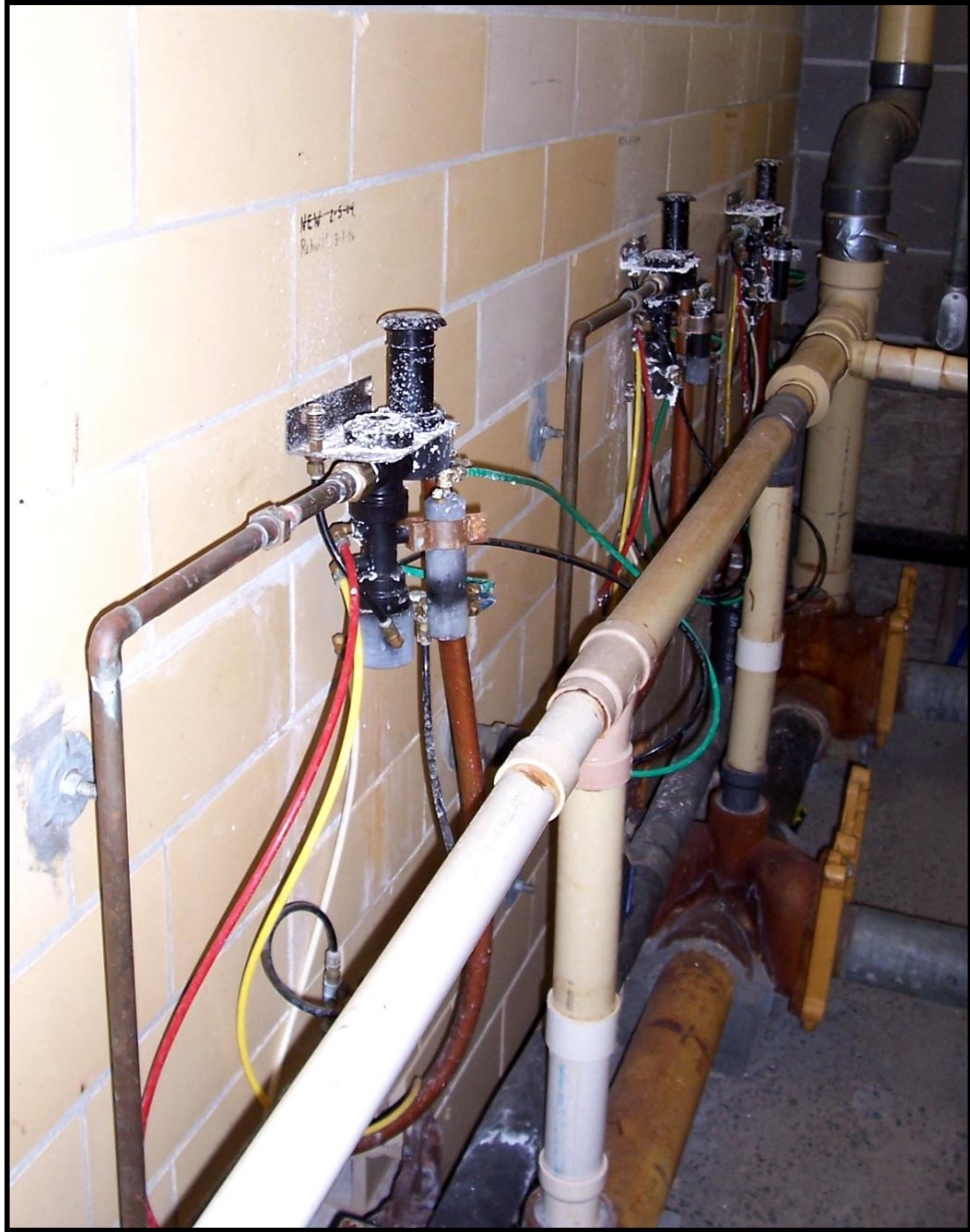
Photo 18. Air valves for toilet operation.