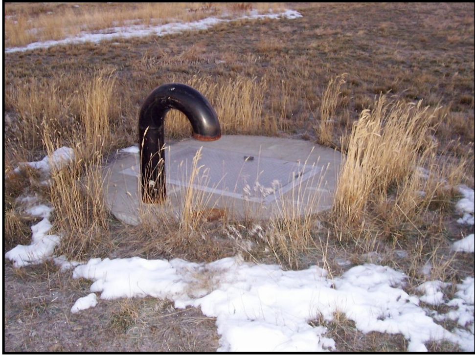
Photo 43. Sewer vent and sewer manhole for Hathaway WB.