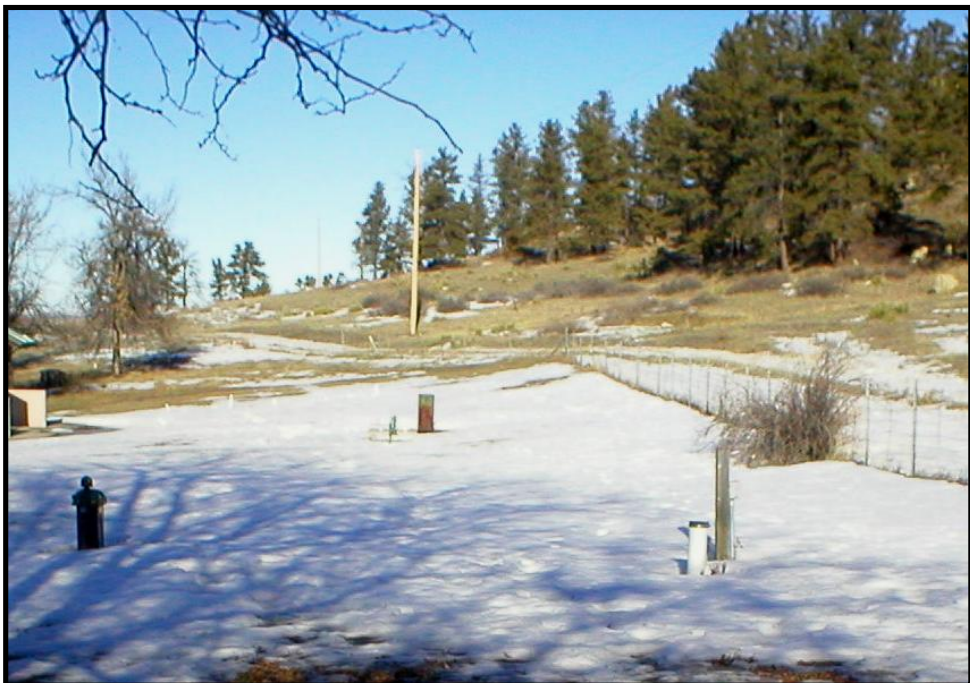
Photo 26. Location of well head, septic tank and power outlet in relation to fence and picnic tables for Hysham EB.