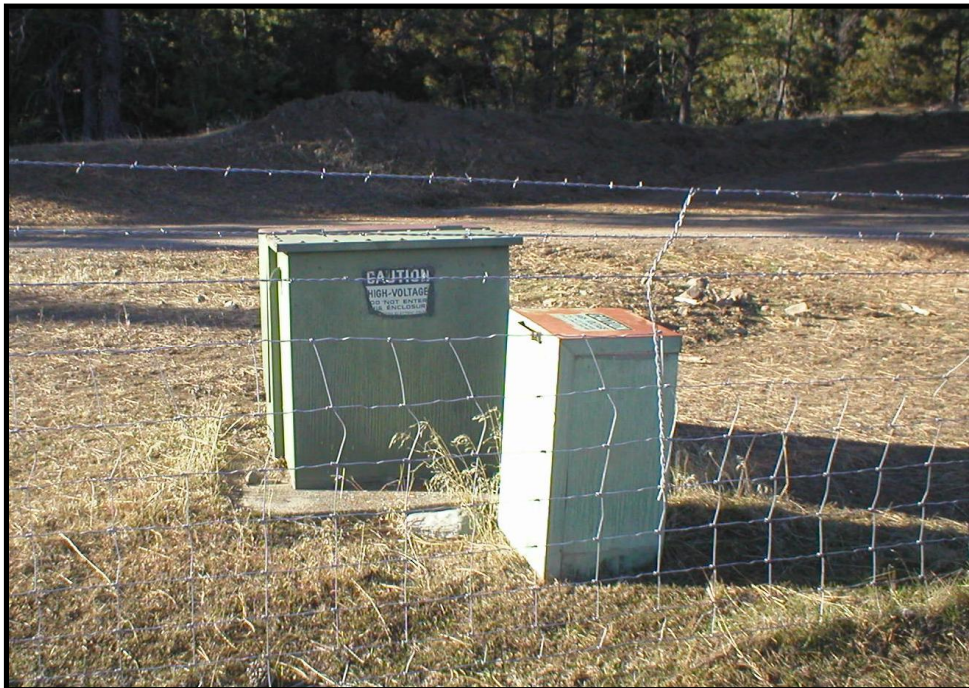
Photo 5. Power source located outside fence at Greycliff EB site.