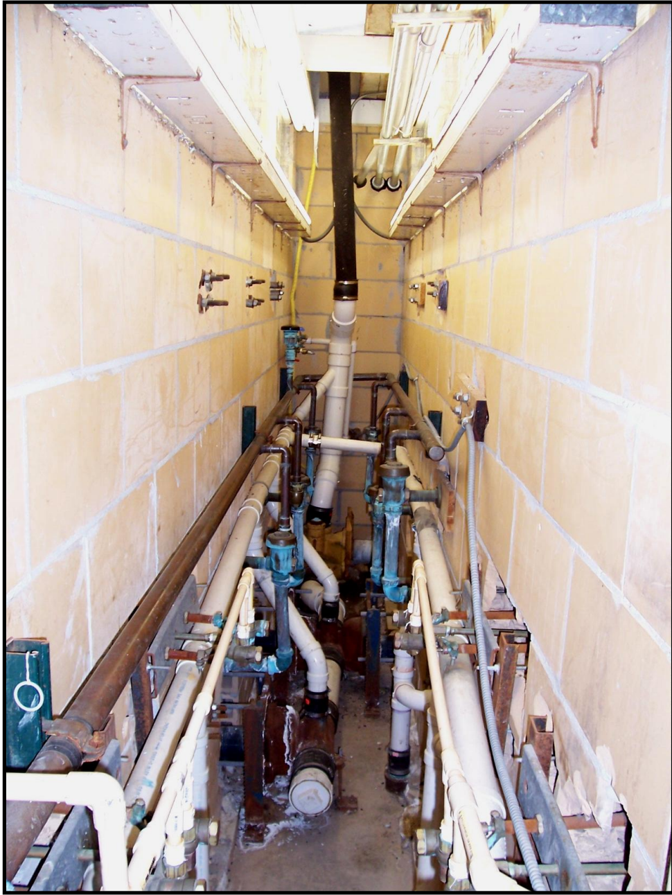
Photo 41. Water and sewer plumbing at Hathaway WB.