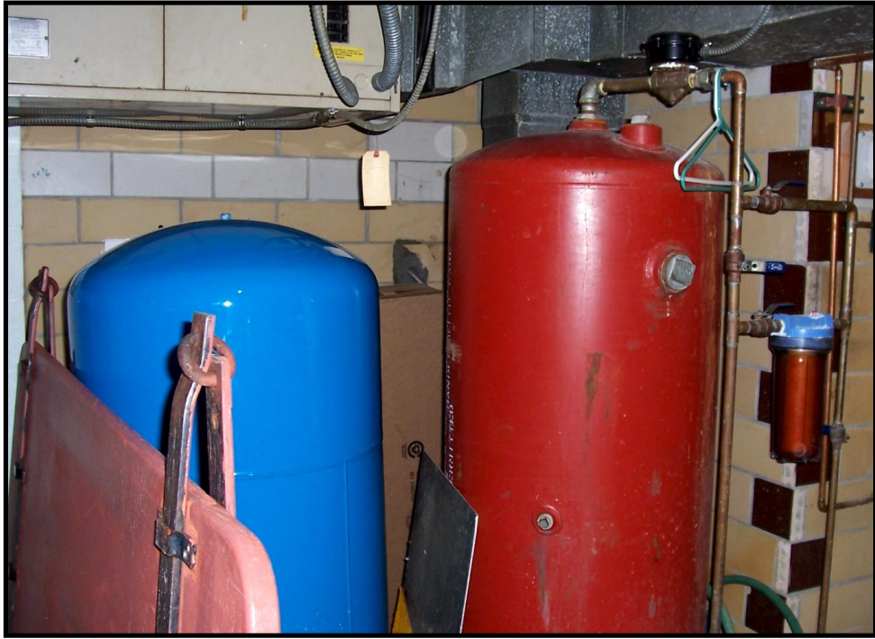
Photo 19. Pressure tanks for Custer EB.