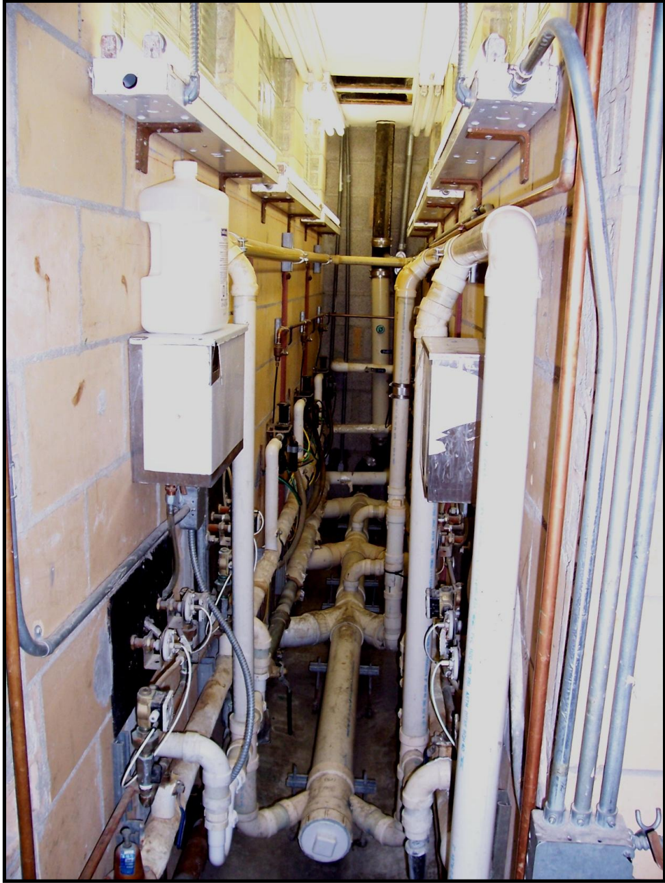
Photo 10. Water and Sewer Plumbing