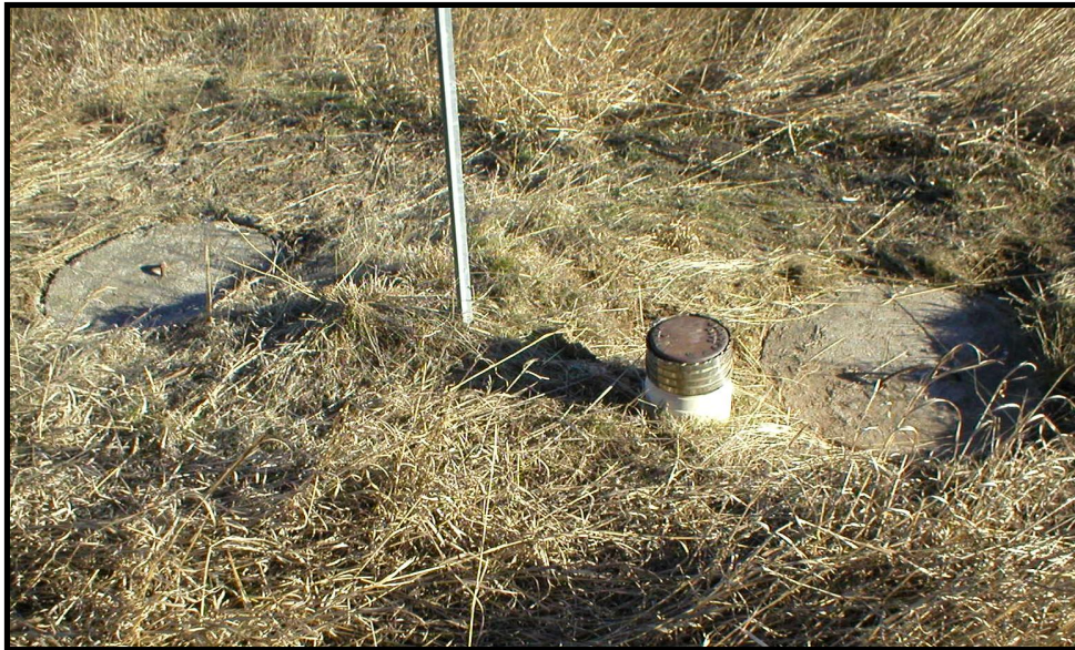
Photo 3. Septic Tank for Greycliff EB.