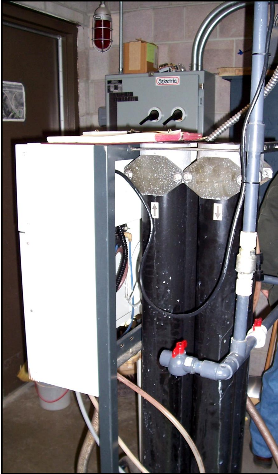
Photo 42. RO unit at Hathaway WB.