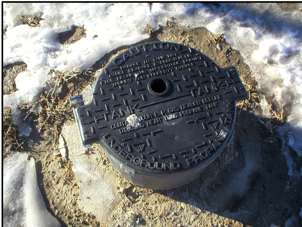
Photo 35. Underground propane tank at Hathaway EB.