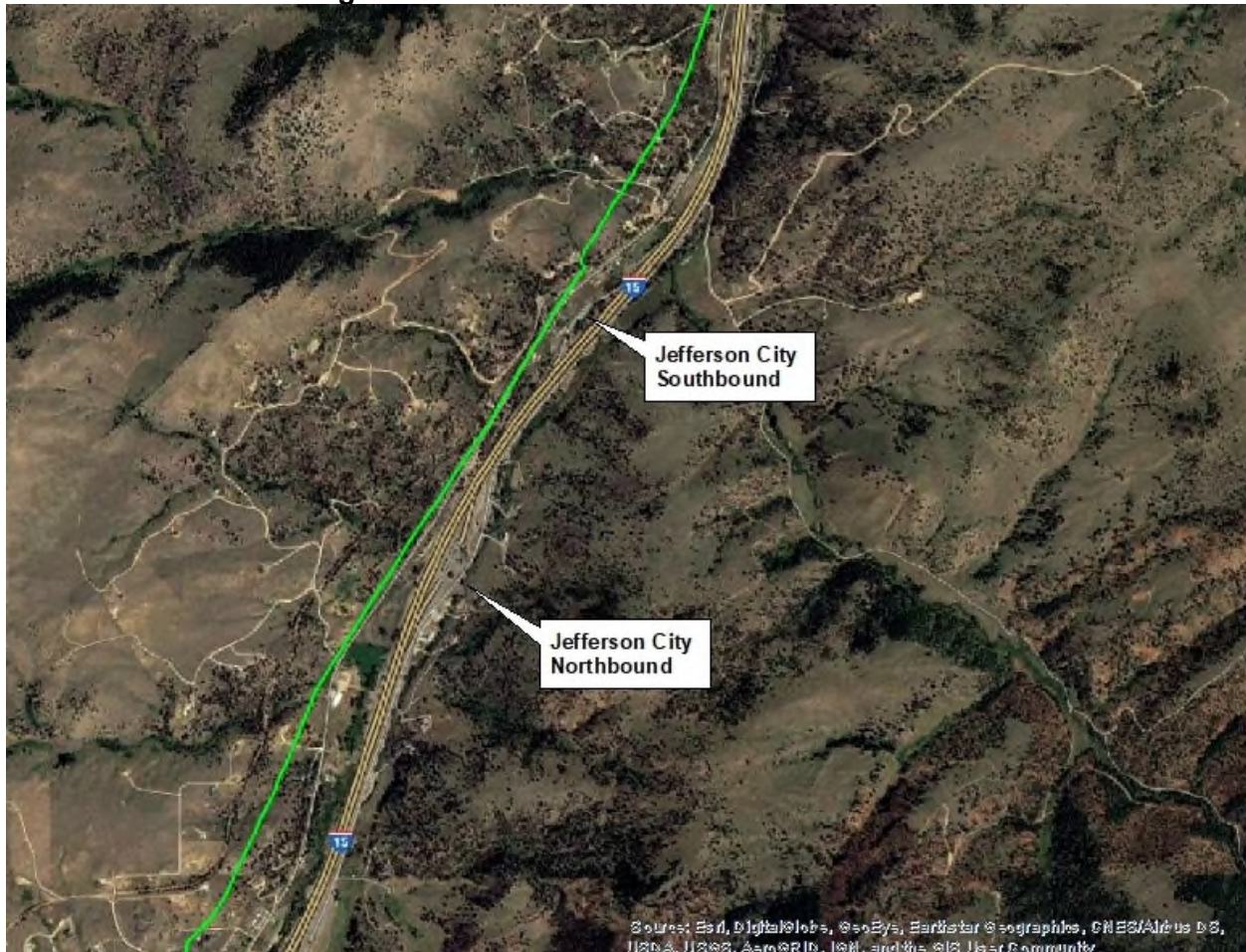
Figure 4: East Helena – Boulder Gas Line