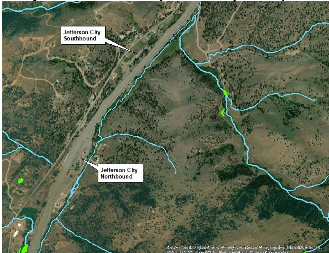
Figure 3: Wetlands and Waterways Within the Vicinity of The Study Area