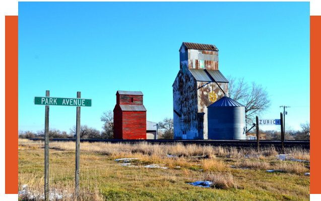
The Zurich E/W project will reconstruct 7 miles of US 2 between Chinook and Zurich.

The Zurich East/West project is located on the Milk River floodplain. MDT is incorporating project specific steps to ensure that highway reconstruction is environmentally conscious. MDT is designing with sensitivity to wildlife passage to the extent practical. Design considerations will be included to ensure that reconstruction does not increase flooding. This project will also take steps to protect the surrounding wetlands from avoidable damage.