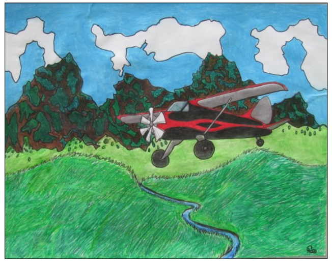
Category II, Middle school students grades 6-8