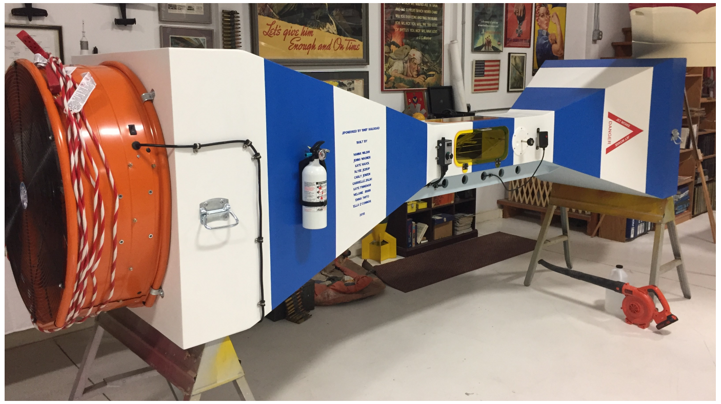
One of three wind tunnels built by Ben Steele Middle School students