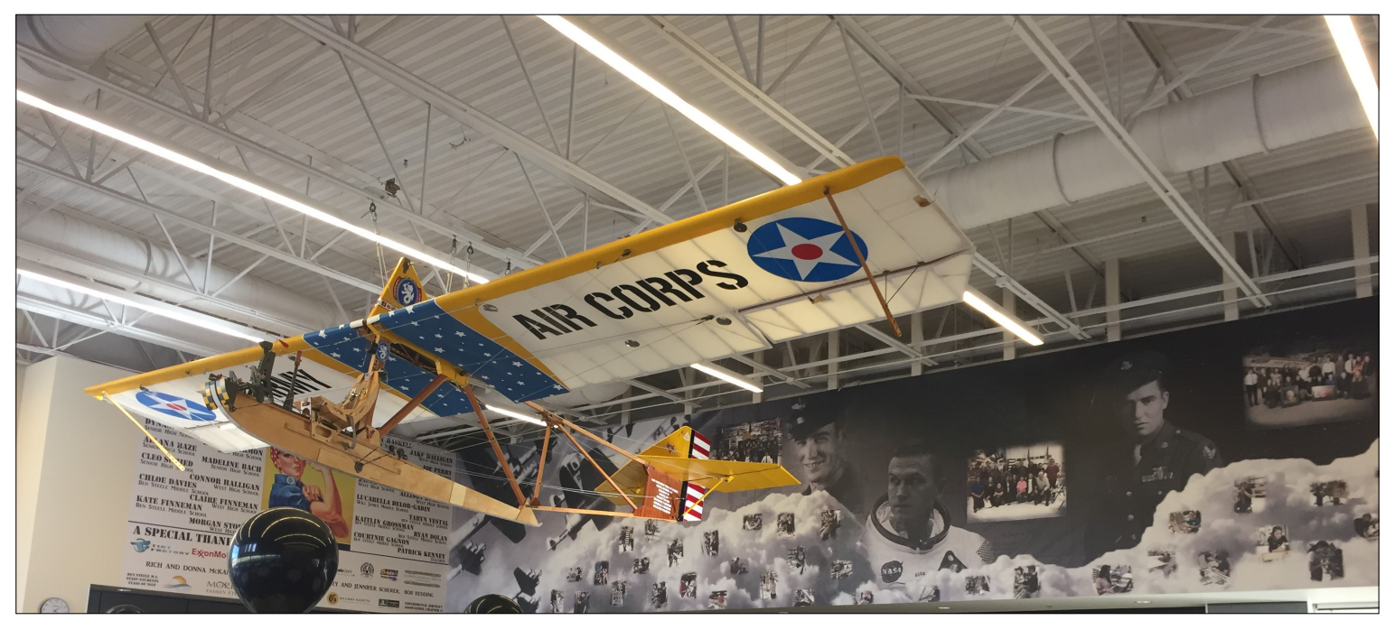
This 800- square-foot mural hangs behind the 1929 Northrup glider in the new Ben Steele Middle School commons listing the names of all the builders, the seventeen community sponsors, and visually depicting the builders construction process while also paying tribute to Colonel Borman, Kit Carson, and Ben Steele.

This is the fifth aircraft to be built by students in EAA Chapter 57's hangar and tentative plans are underway for a sixth student project, a 1935 Boeing 306B.