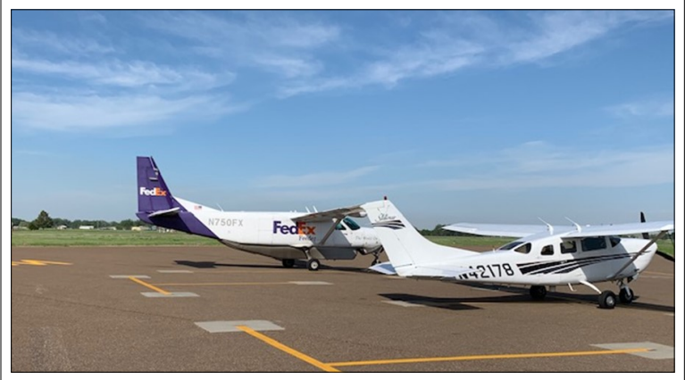
Cessna Caravan waits for cargo at Wolf Point

Summarized with permission from General Aviation News