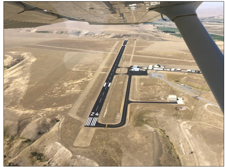
Big Timber Airport after pavement rehab project.

Airport projects funded for Fiscal Year 2022 are listed on page two.