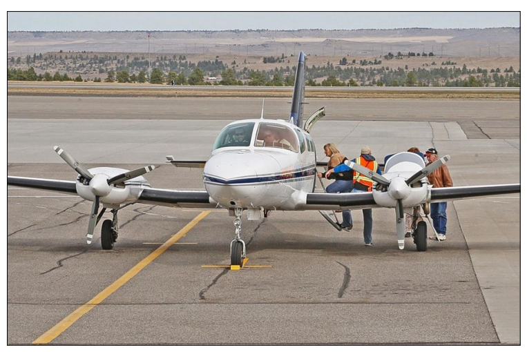
Cape Air passengers board a Cessna 402 in Billings, 2016.

he United States Department of Transportation is issuing a notice in the Essential Air Service (EAS) Program addressing the ongoing impacts of the COVID-19 public health emergency on all communities receiving subsidized air service. A previous notice, issued on April 29, 2020, outlined conditions under which air carriers providing EAS may receive compensation for certain non-completed flights as a result of the impact of the COVID-19 public health emergency. That notice was effective through June 30, 2020, and was extended twice, through September 30, 2020, and through December 31, 2020. The latest notice extends the effective date of the policy through March 31, 2021. The Department observes that carriers participating in the EAS program continue to encounter record-low demand, although with some signs of very slow recovery. Therefore, the Department is acting now to extend the effective period of the notice through March 31, 2021.