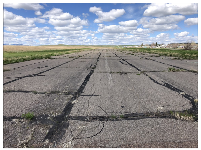
Big Timber Airport before pavement rehab project.

The next Board meeting is scheduled for June 10, 2021, and will cover extension requests to grant applications. All airport extension requests must be submitted in writing to the Aeronautics Division by May 21, 2021.