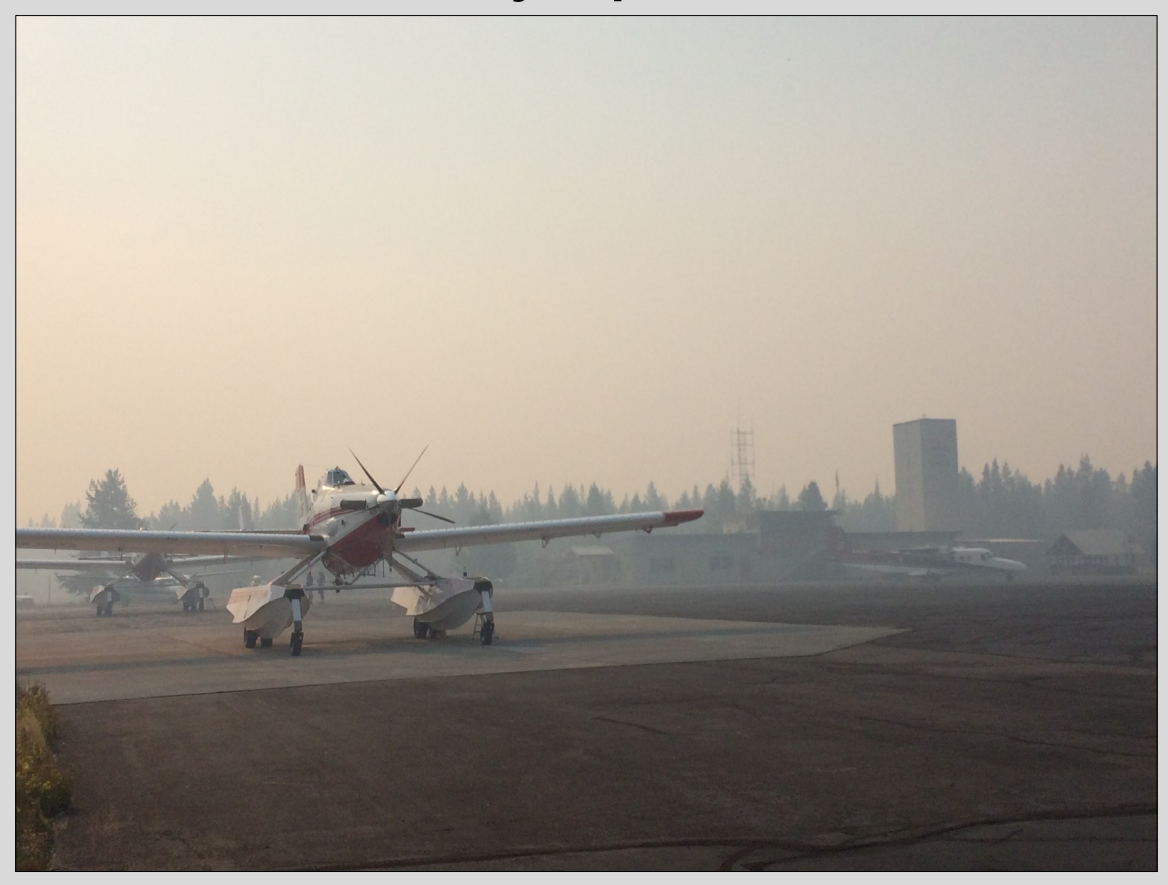
SEATs (Single Engine Air Tanker) AT-802

The Yellowstone Airport is home to the West Yellowstone Fire Center. The United States Forest Service has owned and operated the smokejumper base since 1955. The base was originally established at the old airport west of the town of West Yellowstone before the airport moved to its current location in 1965 where it still operates today. Nationwide, there are approximately 450 smokejumpers, and WYS is home to 28 of them. The primary mission for the base is for a quick response to any wildland fires within the regions of Yellowstone National Park, Teton National Park, Gallatin Custer, and Caribou-Targhee National Forests. However, the smokejumpers are prepared to deploy anywhere in the nation when needed.