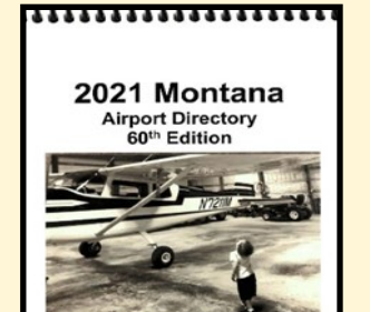
For Reference Only MDT Aeronautics Division