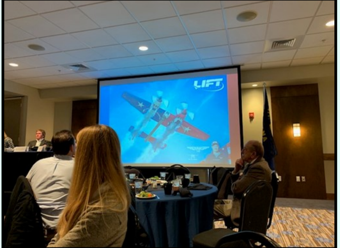
Yak 110 presentation at the Montana Aviation Conference at Fairmont Hot Springs

For your convenience, rooms have been blocked at conference rates at the Holiday Inn Missoula Downtown. Reservations must be made prior to January 31, 2022, to be eligible for the conference rate, and <u>rooms are limited</u>, so make your reservation today! Call the Holiday Inn Missoula Downtown directly at (406) 721-8550 and reference the Montana Aviation Conference to receive the conference rate.