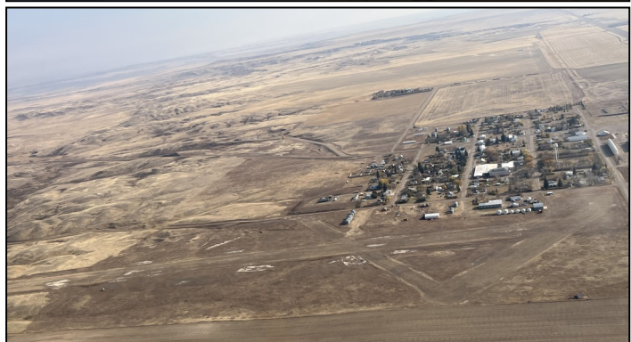
Aerial photos show the wide turf runways that are reminders of Opheim's history supporting bomber operations in Montana.