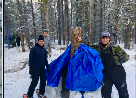
Photos: Winter Survival Clinic participants watch demonstrations of survival skills and put these new skills to the test in an overnight practical exercise.