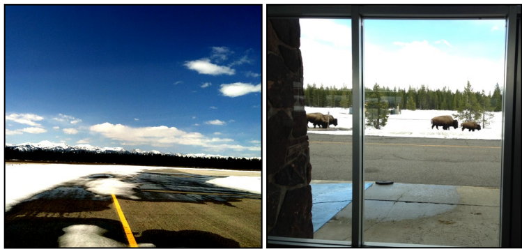
Snow-covered taxiways and bison grazing in front of the terminal mark the seasonal shift in operations at the Yellowstone Airport.

Because the runway is not available for aviation purposes during the winter months, it makes an ideal location to conduct cold weather vehicle and equipment testing. Tires, snowblowers, snowmobiles, and automobiles have been tested at the airport in the past. WYS is the perfect location for testing items under extreme conditions due to its predictable high snow levels and frigid cold temperatures.