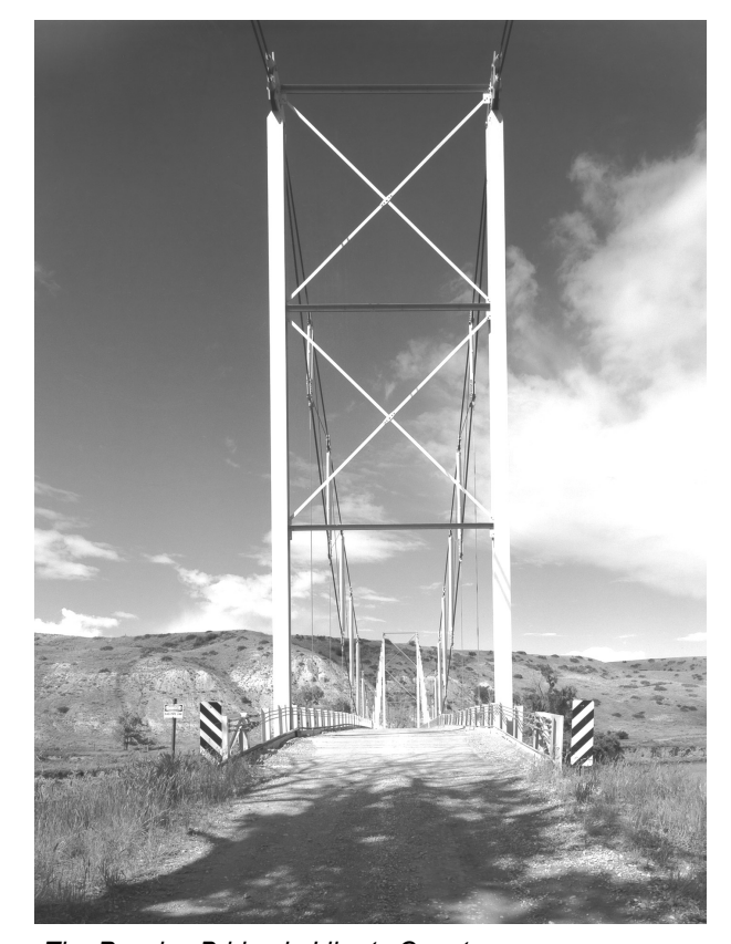
The Pugsley Bridge in Liberty County

The Pugsley Bridge's towers stand in stark contrast to the relative flatness of the northern Great Plains. It is a testimonial to the ingenuity of its designer and of Liberty County for supporting its construction. The bridge continues to serve local ranchers, farmers, and recreationalists. Some may wonder at it now, but at the time of its construction it was hailed as a marvel, a one-of-a-kind structure in the wilds of northern Montana.