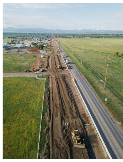
Overhead view of past construction in Belgrade, Mont.

ocal officials are encouraged to review MDT's non-metropolitan transportation planning and programming participation process guidelines and submit comments or proposed modifications to the MDT Planning Division. The process for coordinating and cooperating with non-metropolitan local officials on transportation planning and programming issues is not only good business, but also a product of multiple federal and state statutes and intergovernmental agreements. This participation process occurs at both the statewide and small urban area levels and includes: