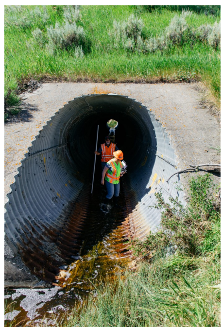
MDT crews inspecting a culvert

Find out more about MDT's MS4 program and how you can get involved in storm-