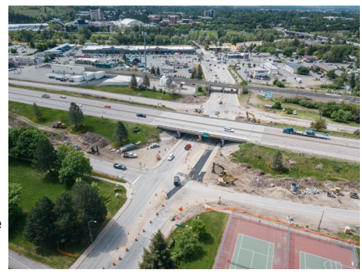
Overhead of Van Buren Interchange project in Missoula, Mont.

– selected by an independent panel of industry judges – and the People's Choice Award, chosen by the general public through online voting. While the Van Buren Street Interchange Project will not be one of the projects advancing to this phase of the 2020 competition, we (MDT) extend our best wishes to the state DOTs selected. To learn more about ATA or to view past projects submitted by MDT, visit americastransportationawards.org.