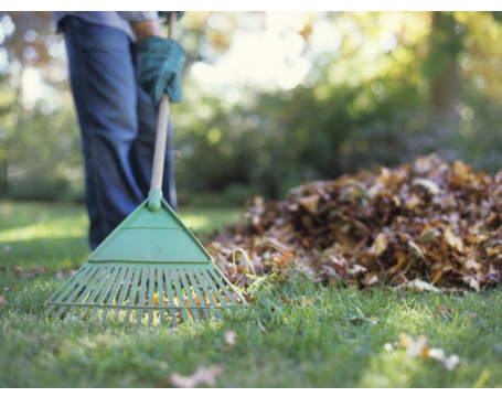
Do your part this fall to help keep pollution out of stormwater runoff, and ultimately, out of Montana's waterways!

or many Montanans, outdoor resources and open spaces are some of our most precious assets. And the fall season is no exception, as we venture out to hike, camp, bike, fish, hunt or float one of the breathtaking waterways our vast state has to offer. There are several things you can do at home or on your adventures this fall to prevent stormwater pollution, keeping Montana's waterways clean for the future.