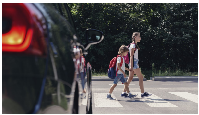
Slow down and watch for increased pedestrian and bike traffic around schools.

Watch for children walking or bicycling when backing out of driveways and garages and when exiting alleyways.