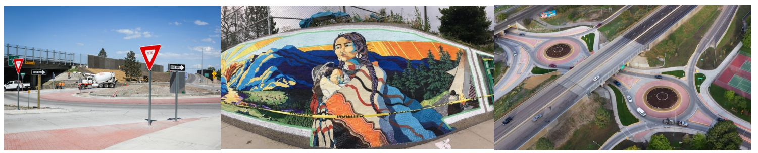
Left: The new Van Buren Interchange in 2019; Center: Finishing touches on the interchange mural; Right: A birds-eye view of the completed roundabouts