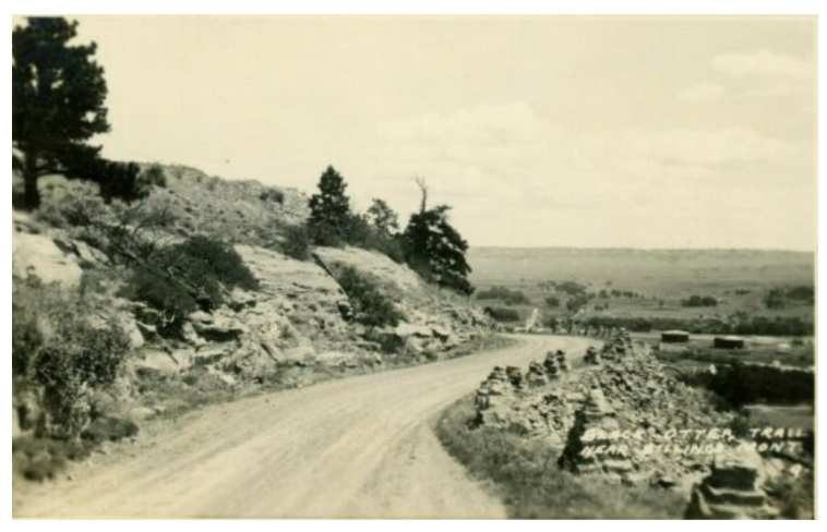
Postcard view of the Black Otter Trail in Montana (1937)

Designed by Yellowstone County Surveyor Charles E. Durland, the road stretched from Kelly Mountain on the east end of the rims overlooking the fairgrounds westerly to the airport. It opened in 1928 with a loop encircling Skeleton Cliff. Observers on the loop could see seven mountain ranges in the Billings vicinity. WPA crews started work on the road in March 1936 and built about thirty percent of the road before a lack of funding forced the WPA to abandon the project; they never returned. Yellowstone County furnished the materials and construction equipment. In 1937, the Billings City Council completed construction of the road. When completed, the trail included turnouts at scenic and historic points. Guard walls and retaining walls composed of native sandstone kept traffic on the road and prevented motorists from taking the quick way to the base of the rims. Historical markers echoed the appear-