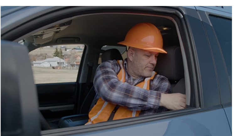
The new media spot "Buckle Up—Enough Reasons" shows Montanans of all ages and backgrounds making the right choice to wear their seat belt.

Over time, tactics of shocking or shaming motorists into better behavior have not proven to be an effective traffic safety messaging strategy – particularly with the most resistant, risky drivers! MDT's "One Reason" traffic safety campaign is in step with a nationwide effort to promote a positive traffic safety culture with strategies fo-