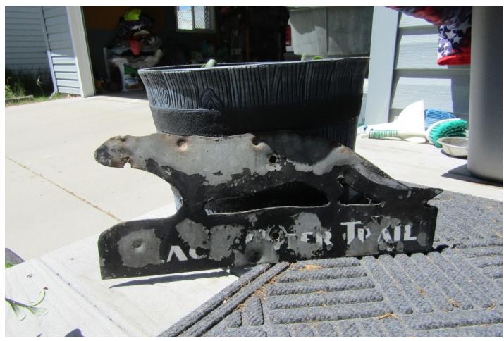
Original trail marker for the Black Otter Trail (c. 1937) recently acquired by the author

ance of the Montana Highway Department's roadside markers; they were composed of log support posts, concrete bases faced with stone, and wood boards. Concrete pyramids veneered in cobblestones held metal pipes with telescopes mounted on them. In many ways, the new trail was a smaller facsimile of the Going to the Sun Road. Importantly, the trail also incorporated the grave of Luther S. "Yellowstone" Kelly. Kelly became a renowned scout for the U.S. Army during the Indian Wars. When he died in 1928, he specified he be buried on top of the rimrocks overlooking his beloved Yellowstone Valley.