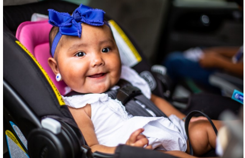
Make sure your child is in the right car seat for their safety!

and seat belt misuse rates vary from 74-90%. That is why it is so important to choose and use the right car seat correctly every time your child is in the car.