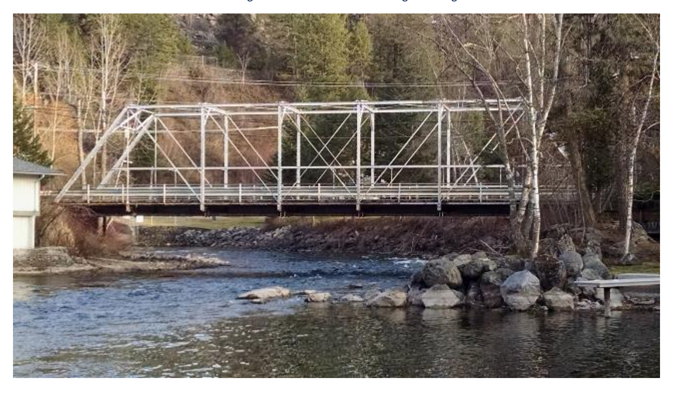
Figure 1: Swan River Bridge in Bigfork

The 1912, Pratt pin-connected through truss bridge leading into downtown Bigfork, Montana originally served this community as a vital river crossing into a frontier commerce center. Over a century later, the single-lane bridge with an added sidewalk provides a secondary entry into Bigfork but also serves as an iconic symbol for the current business and tourist community located on Flathead Lake.